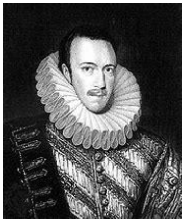
St. Philip Howard

One of the Forty Martyrs of England and Wales. Philip was the Earl of Arundel and Surrey and, although a Catholic, led a religiously apathetic life until his personal conversion, after which he was a zealous Catholic in the midst of Elizabethan England. Arrested by authorities, he was placed in the Tower of London in 1585 and condemned to death in 1589. The sentence was never carried out, and Philip languished in the Tower until his death at the age of thirty eight.