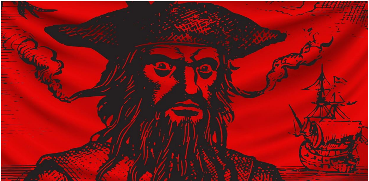
Blackbeard a.k.a Edward Teach

Topsail's history tells us of famed Pirates like Stede Bonnet and Charles Vane, but the most notorious of them was Blackbeard, also known as Edward Teach. The very mention of his name left many with the hairs on their skin standing upright. He was feared across the seas from Barbados to New York. He was known as the cruelest pirate and a master of psychological warfare. He often used his fearful appearance to terrorize and manipulate his opponents — he was over six feet tall with long beaded beards in which he tied cannon fuses and sulfur matches that he would light up before torturing his victims. This gave them the image of an evil creature; a giant with his beards on fire and smoke emanating from his head. He always had three pistols strapped to his chest with a sling, and a cutlass strapped to his hip. He was known to show no fear and give no 'quarter' (mercy). Aren't you glad you weren't on the earth in that era?!