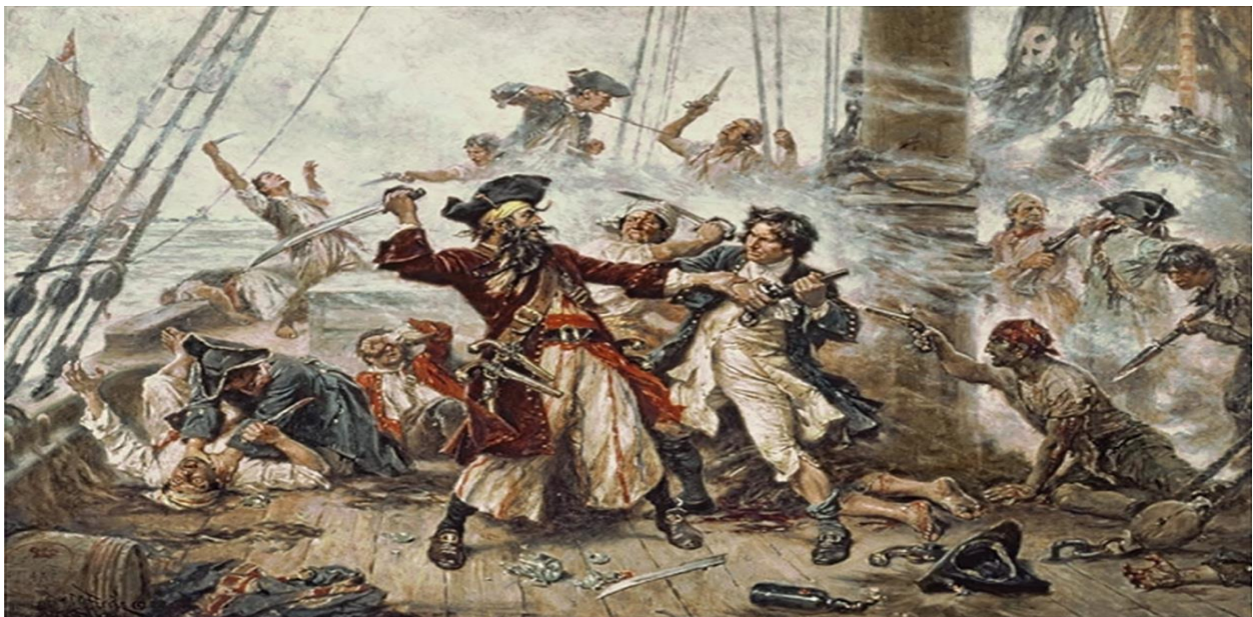
Blackbeard and Lt. Maynard, painting by Jean Leon Gerome Ferris (c. 1863–1930)