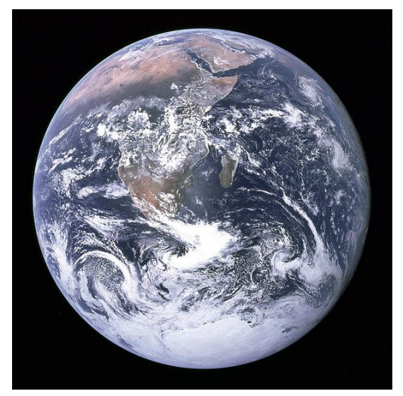
The Earth seen from Apollo 17 http://en.wikipedia.org/wiki/Holism

In other words, "making sense" of something (learning) is a complex process of both connecting and contrasting ideas, of synthesis and analysis . Synthesis and Analysis are the backbone of all human understanding. Example: