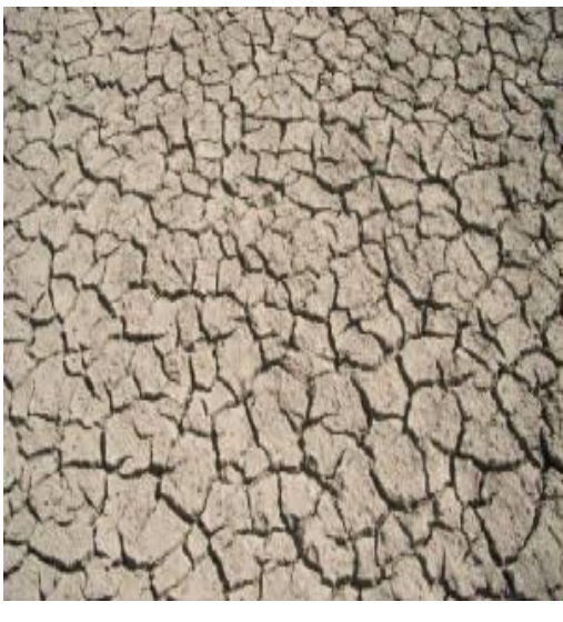
Parched earth resulting from a drought <a href="http://dampwater.tripod.com/id4.html">http://dampwater.tripod.com/id4.html</a>

Both images above are of the same planet Earth; the wide-angle, holistic view of it is different from the close-up image of a tiny part of it on the right. When learning, our 'mind's eye' shifts from wide-angle to zoom; what we see will depend on the kind of lens (perspective/ view /mode of reasoning) that we use.