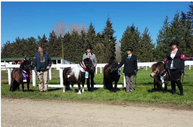
South Canterbury Equestrian Show Adult and Youngstock Champions