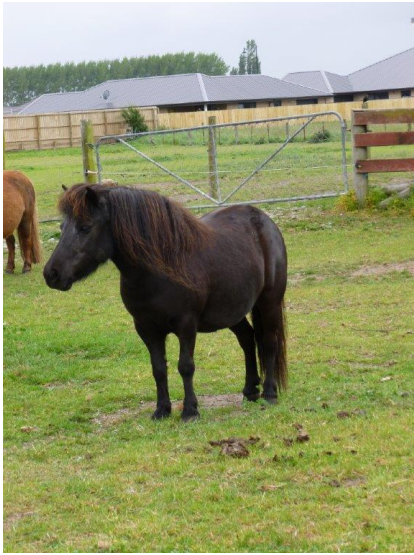
Oaklea Buttons 'n Bows (Dot) (Black) Sire: Narrandera Vicount Dam: Narrandera Uanda