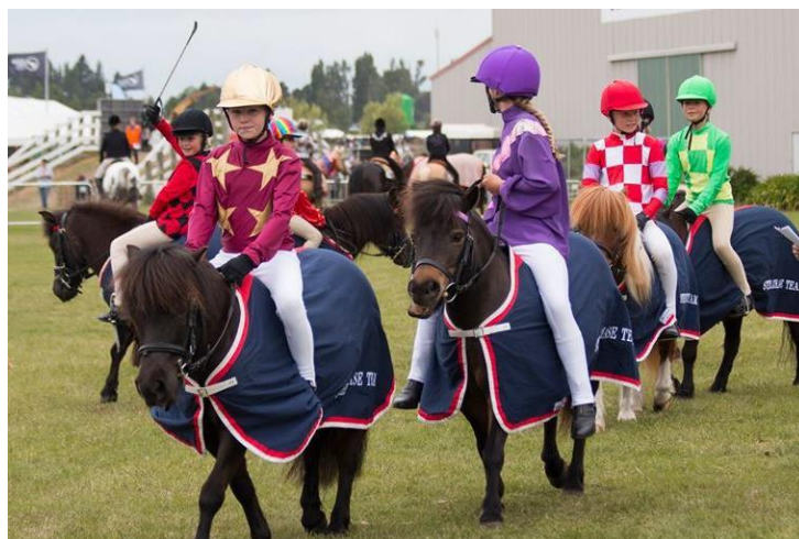
Looking relaxed before the big race: L-R: Jelly (the substitute pony), Beechgrove Muffin Magic (stars), Llewellyn Spellbound (head only) Cotswold Polly Hester, Beechgrove Basil Brush, Llewellyn Merlin.

I was then faced with the daunting task of telling another parent that their child (the last one on) would not be able to ride as we were one pony short. As luck would have it, the family just happened to have a quiet Shetland pony in their paddock at home, (with the unfortunate name of 'Jelly'!) which had hunted in its earlier days, so less than 24 hours before the race we had a substitute. I didn't see the pony until race day but at that point, as long as it looked like a Shetland, I really couldn't have given a toss, as I was mentally stressed to the max by this stage.