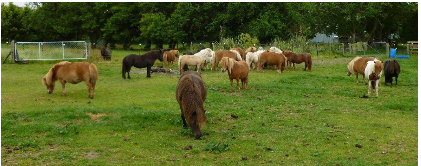
Group stud photo