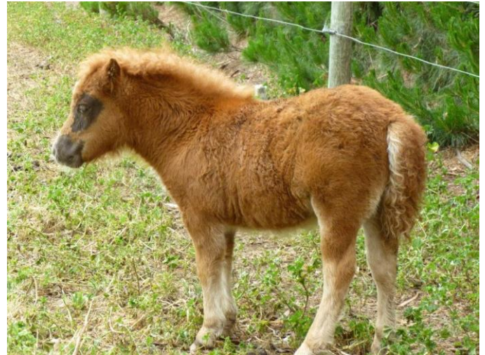
Oaklea Isadore (name pending) born 9.10.16 Sire: Narrandera Veringo Dam: Cotswold Davina Dainty