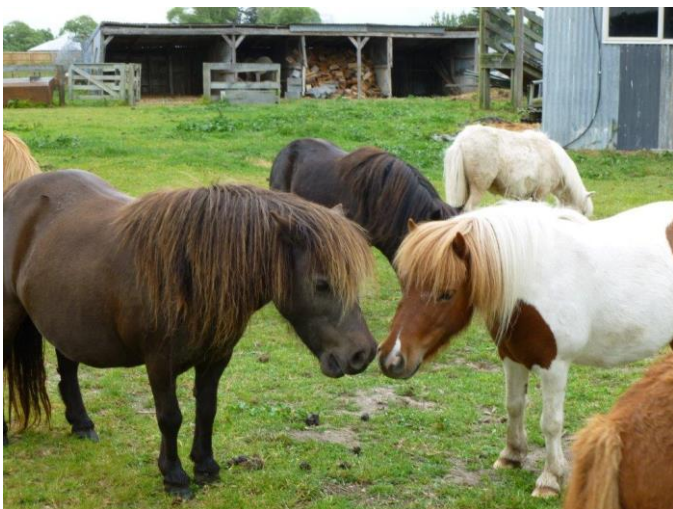
Narrandera Vanora (Blue) Sire: Laurelwood Quazar Dam: Narrandera Libby and Oaklea Esperanza (Ellie) skewbald Sire: Narrandera Vicount Dam: Narrandera Quito

Time consuming, time wasting, expensive, non-judgmental listeners that love attention.