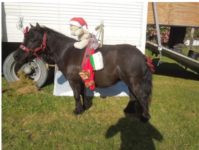
Little Rockisle Black Onyx dressed for her part in the display.