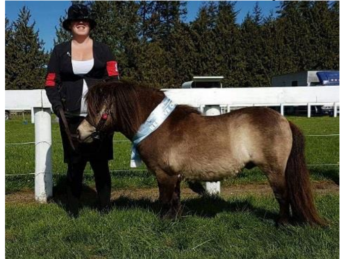
South Canterbury Equestrian Show Reserve Champion Adult – Domino Downs Bailey (Imp. Aust) and handler