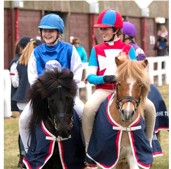
Llewellyn Moody Blue and Cotswold Foxfire

Training settled down for a few days and we proceeded with 9 riders and 9 ponies which I was continually juggling around to try and sort out the best combinations. This year we had four new riders, and four tall riders, so I was fairly limited as to who could ride what. I always find this rather stressful and just when I think I have it sorted, a problem occurs and I have to go back to the drawing board.