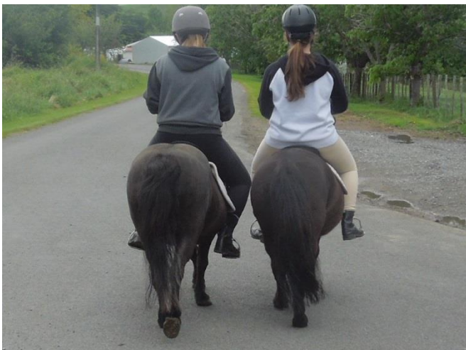
Barnsley Father Billy and Huntingdon Bliss out for a ride before our display