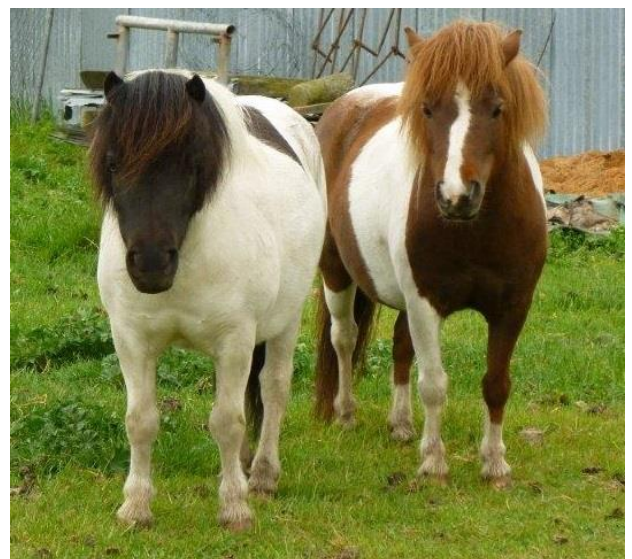
Narrandera Casey (Casey) (piebald) Sire: Narrandera Snippy Dam: Narrandera Yardine and Narrandera Bella (Bella) (skewbald) Sire: Narrandera Veringo Dam: Otway View Querida