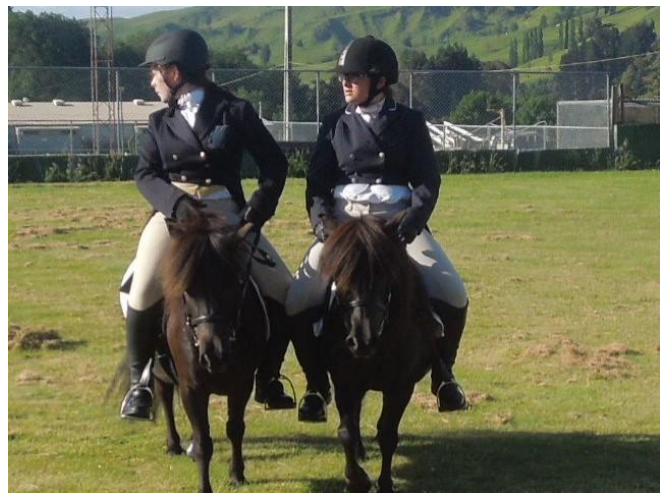
Barnsley Father Billy and Huntingdon Bliss looking smart