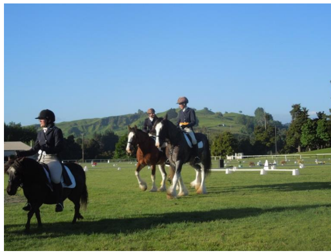
The quadrille with the Clydie's