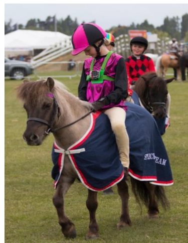
Cotswold Burbury Twill – the Steeplechase Winner