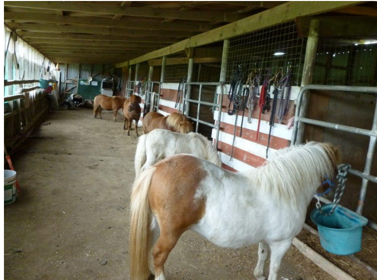
All lined up in the stable to get their feet trimmed, front to back: Oaklea Cheeky Charlie (Charlie) skewbald Sire: Narrandera Vicount Dam: Narrandera Undara Oaklea Hannover (Chewy) Cremello yearling Sire: Narrandera Veringo Dam: Narrandera Wendy Oaklea Cornelius (Havic) Chestnut Sire: Narrandera Vicount Dam: Narrandera Uanda Oaklea Delilah (DeeDee) Chestnut Sire: Narrandera Vicount Dam: Narrandera Uanda Oaklea Delacore (Harry) Chestnut Sire: Narrandera Vicount Dam: Narrandera Undara