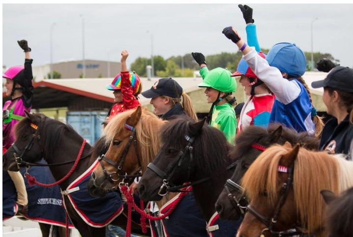
Llewellyn Spellbound, Cotswold Foxfire, Llewellyn Moody Blue, Jelly, Beechgrove Basil Brush

The Steeplechase ran like clockwork and everyone was happy. The crowd gathered from nowhere and cheered the ponies and riders on. Just when it looked like Polly had the race won, Burbury burst through and beat her by half a head, followed by Blue, Foxy, Muffin, Merlin, Ella, Basil and Jelly. After the race, ponies and riders gave the crowd their money's worth by doing several laps of honour, and continued to steal the show in the Grand Parade when they were first to enter the arena and last to leave.