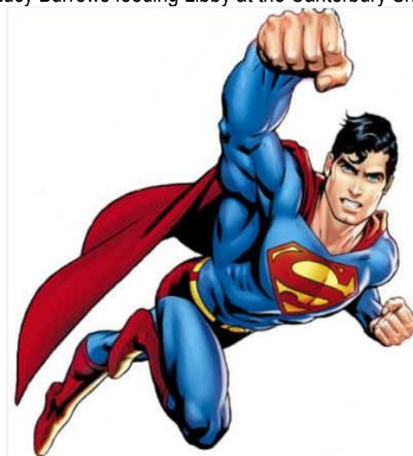
The Superman pose

I want that horse back The one called Anzac I looked after him for a while It was a bit like a trial Now of course I want a horse!