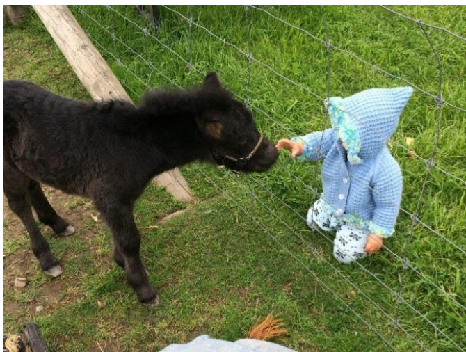
The babies hanging out