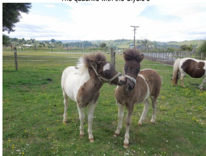
This season's foals (names pending)