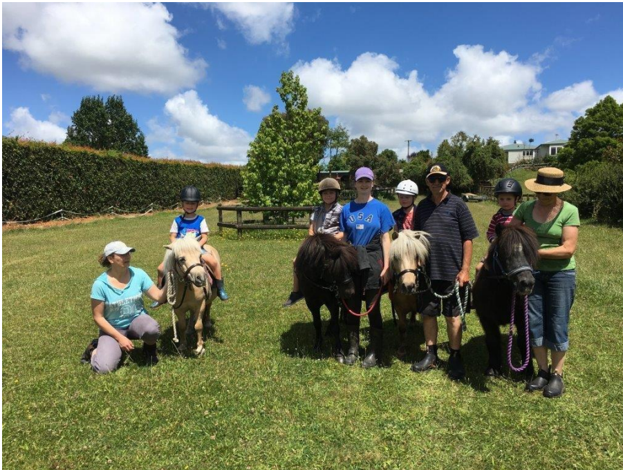
Narrandera Sateen, Burravoe Randolph, Gleneagles Crème de la Crème and North Close McDhui