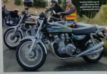
Motorcyclists riding on a track.

Text describing the Honda CBR1000RR, focusing on its aerodynamic design, power output, and safety features.