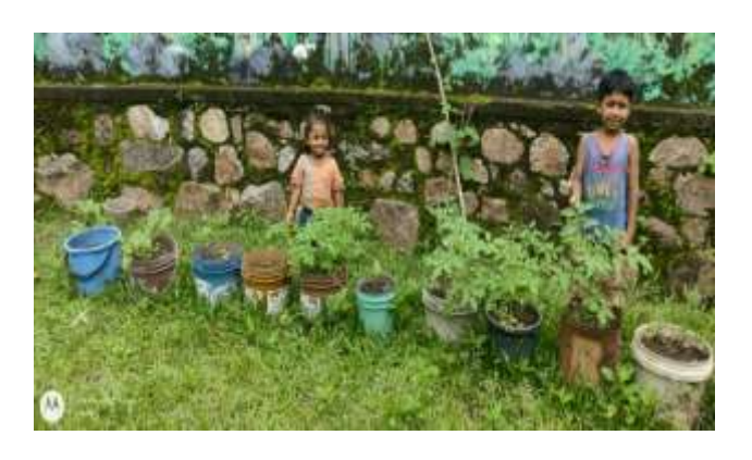
Children's nutria garden in Guadnggorjang model village as a part of anganwadi training