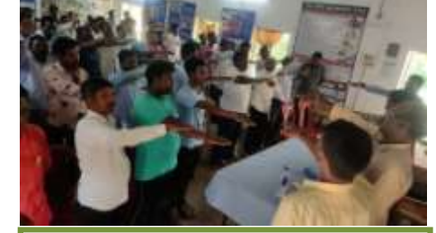
Oath taken by the religious leaders to stop child marriage

active part and also gave their suggestions which will help them to create awareness among adolescents, parents, youths to reduce child marriage. At the end of the program the religious leaders took an oath to stop child marriage in their area. This program was very participatory and helpful for everyone present in the meeting.