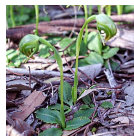
Nodding Greenhood Pterostylis nutas