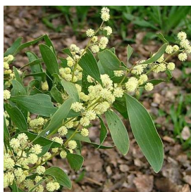
Blackwood Acacia melanoxylon

Brighten up a gloomy winters day with some of these stunning flowers that bloom during the winter months. Let flowers act as an antidot to your winter blues! Get outside this weekend and see if you can spot them.