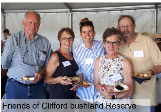
Friends of Clifford bushland Reserve

Once again, congratulations to these groups who tirelessly and passionately continue to protect the biodiversity across the Peninsula.