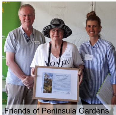
Friends of Peninsula Gardens