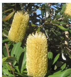
Coast Banksia Banksia Integrifolia