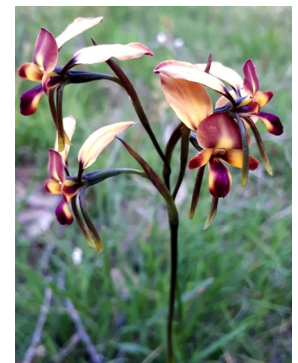
Donkey Orchid ( Diruis Sp. ),