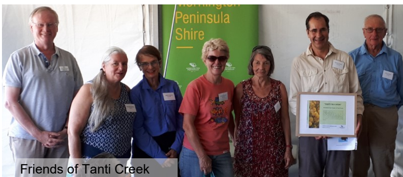
Friends of Tanti Creek