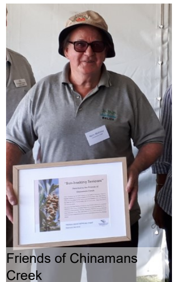
Friends of Chinamans Creek