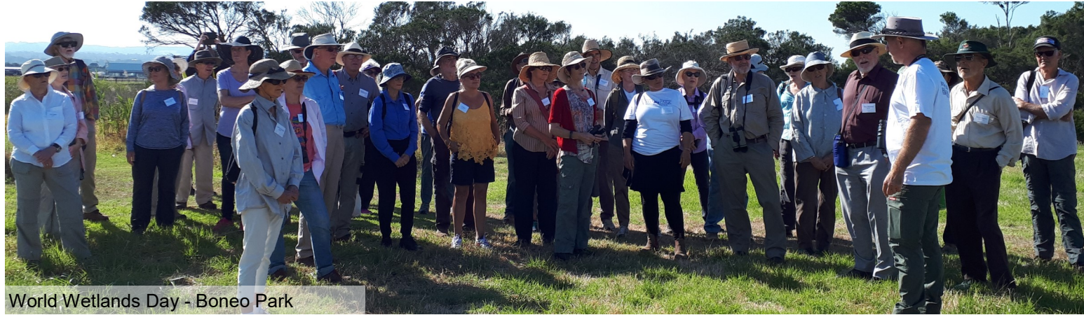
World Wetlands Day - Boneo Park