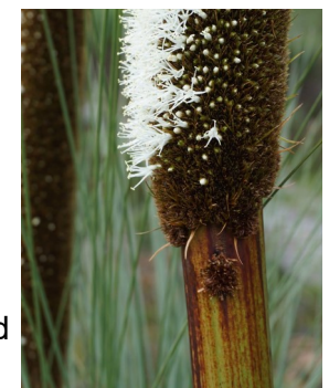
Grass tree flower spike ( Xanthorrhoea australis ).