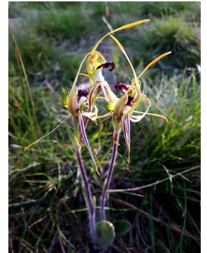
Small Spider Orchid ( Caladenia parva ),

Sign-up and make a listing- Don't miss the opportunity to advertise your group online.