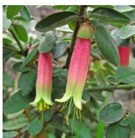
Common Correa Correa reflexa