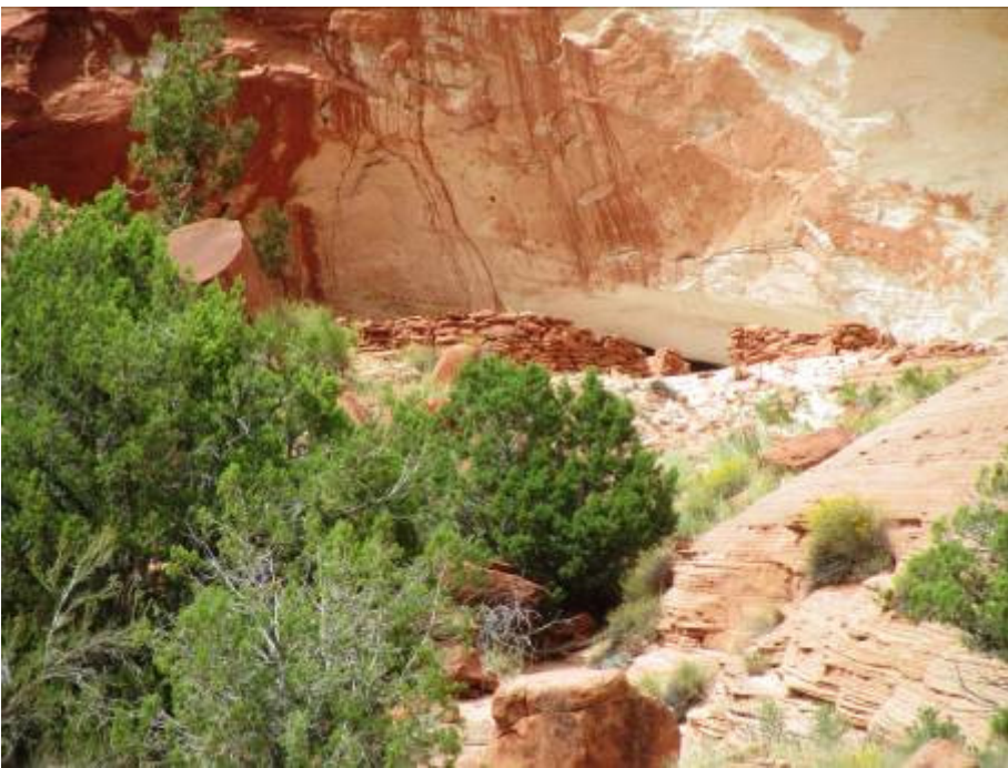
A habitation site in another alcove