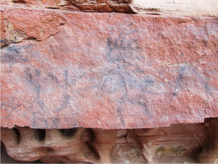
Faux pictographs at the cave entrance