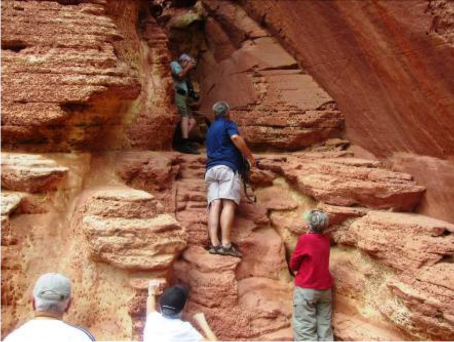
Someone had to take pictures – thanks Dave