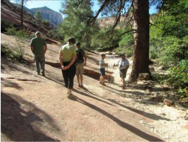
Getting ready to walk back to the trailhead