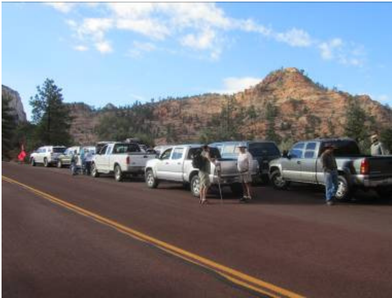
The parking lot was full