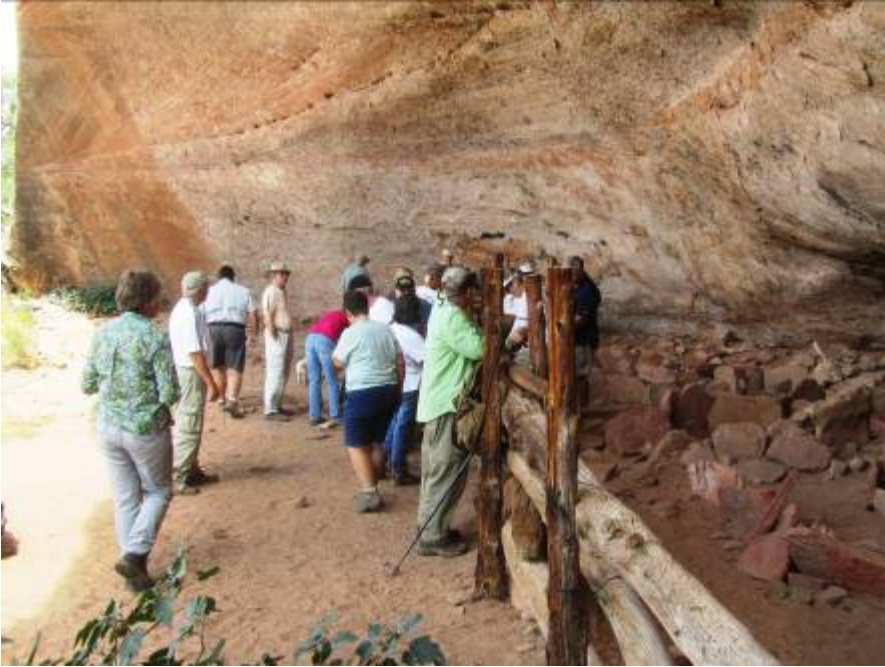
The group looking at the ruins in the habitation alcove