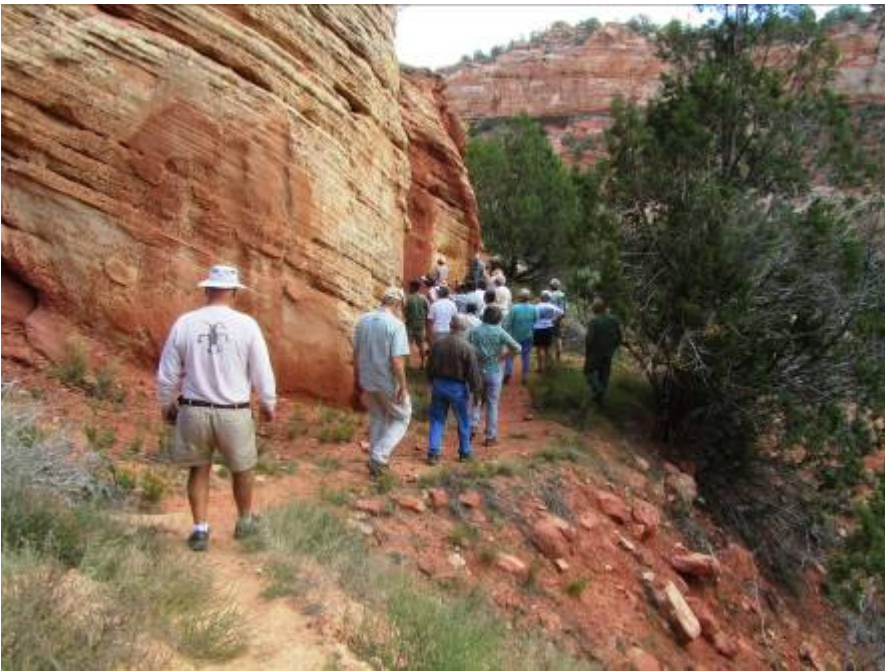
The short hike to the petroglyphs