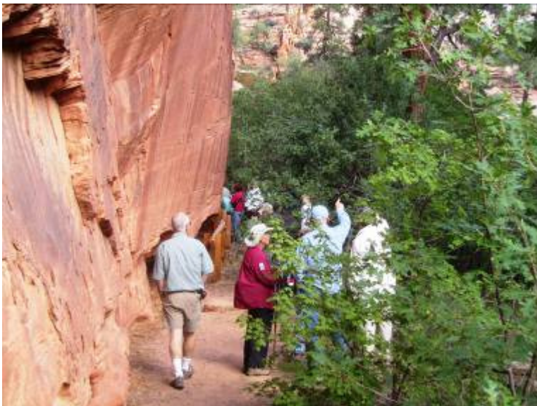
At the site