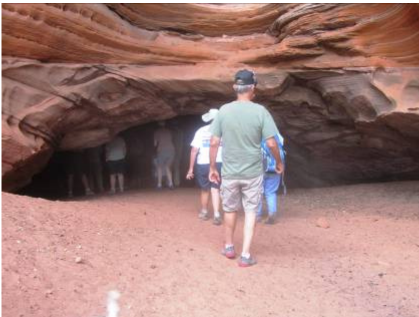
Entering the cave with the underground lake