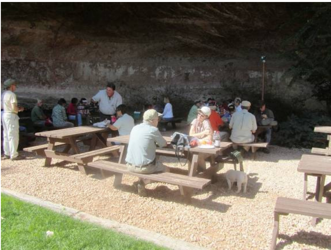
Lunch at Angel Canyon