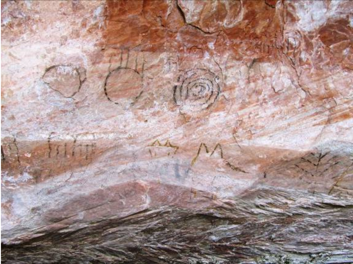
Some faux pictographs at the lunch alcove