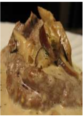
sodium broth 2 tablespoons heavy cream