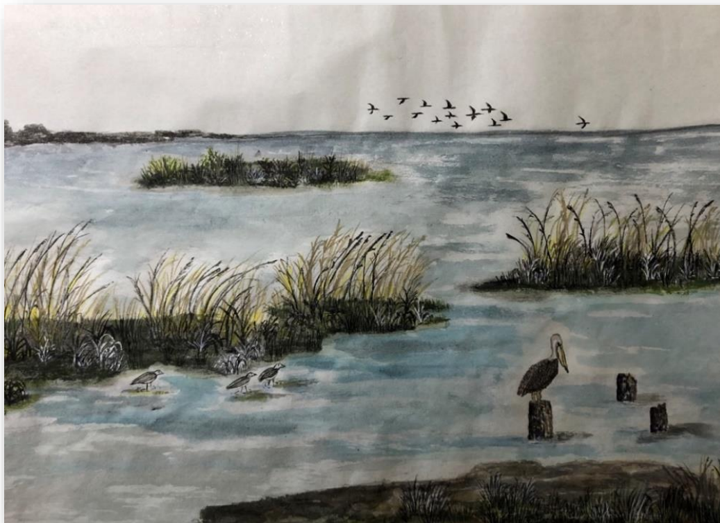
Marsh Serenity, Painted August 2022

So as a first-time artist exhibitor, I am excited to show off my work. But at the same time, I am humbled by the incredible talent around me in the Blue Heron community.