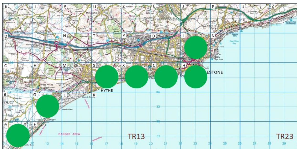
Figure 3: Distribution of all Caspian Gull records at Folkestone and Hythe by tetrad

Figure 3 shows the distribution of records to date. Nine have been found in the Folkestone Harbour area, with the others at Battery Point/Sandgate (5), Nickolls Quarry (3), Hythe (2), Hythe Ranges, Haguelands and the Willop Basin.