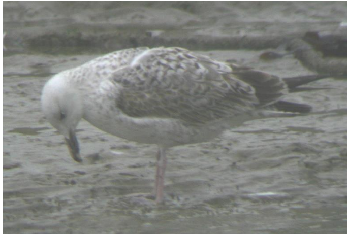
Caspian Gull at Folkestone Harbour

Upperparts: The mantle was grey with bars and diamond-shaped spots. The lesser coverts were dark and formed a distinct contrast with the white underparts. There were some new feathers in the outer median and greater coverts, with the older feathers plain and brown, with paler tips especially on greater coverts. The tertials formed a dark block with pale tips (although worn) and the primaries were dark. The upper-part pattern matched closely the illustration in Olsen & Larsson (2005, plate 42, p. 310, bird no.3).