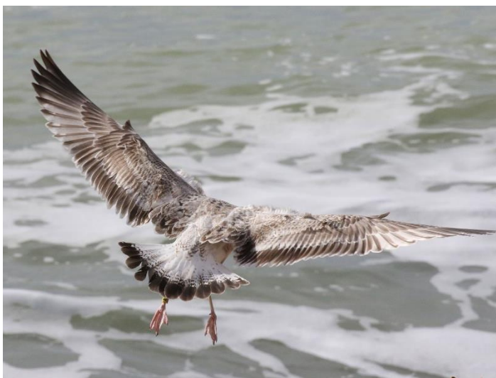
1CY Caspian Gull at Sandgate (Chris Powell)