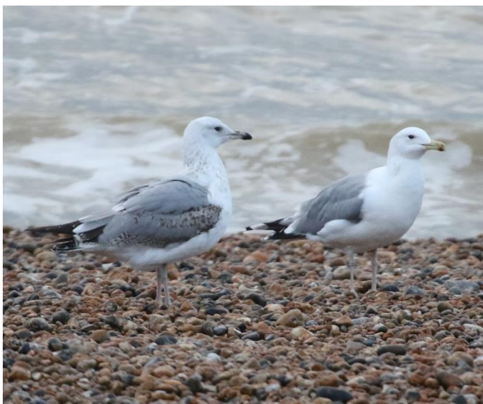
2CY and adult Caspian Gulls at Sandgate (Ian Roberts)