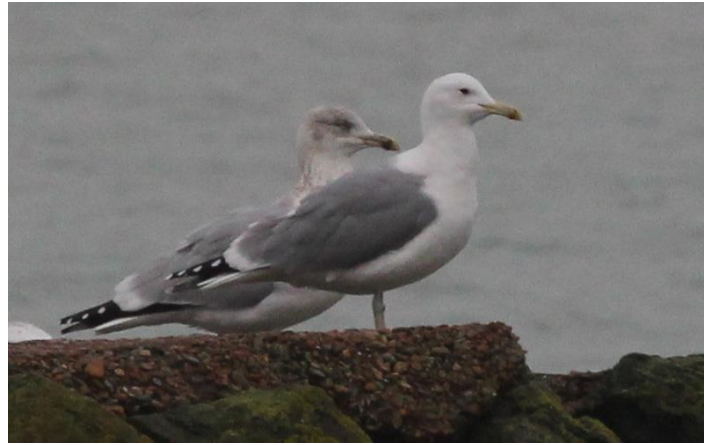
Adult Caspian Gull at Folkestone Harbour (Ian Roberts)