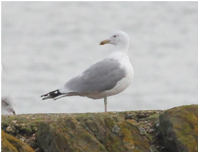
Adult Caspian Gull at Folkestone Harbour (Ian Roberts)