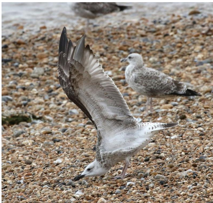
1CY Caspian Gull at Sandgate (Chris Powell)

In Kent it is a scarce but increasingly frequent visitor, especially in the Dungeness area (KOS 2022).