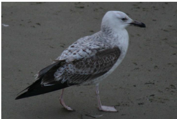
1CY Caspian Gull at Folkestone Harbour