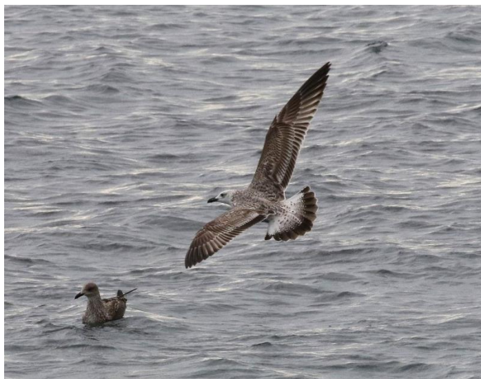
1CY Caspian Gull at Sandgate (Chris Powell)