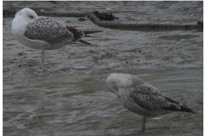
Caspian Gull (left) at Folkestone Harbour