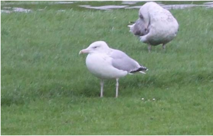
3CY Caspian Gull at Hotel Imperial golf course (Ian Roberts)