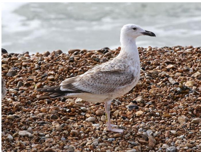
1CY Caspian Gull at Sandgate (Chris Powell)