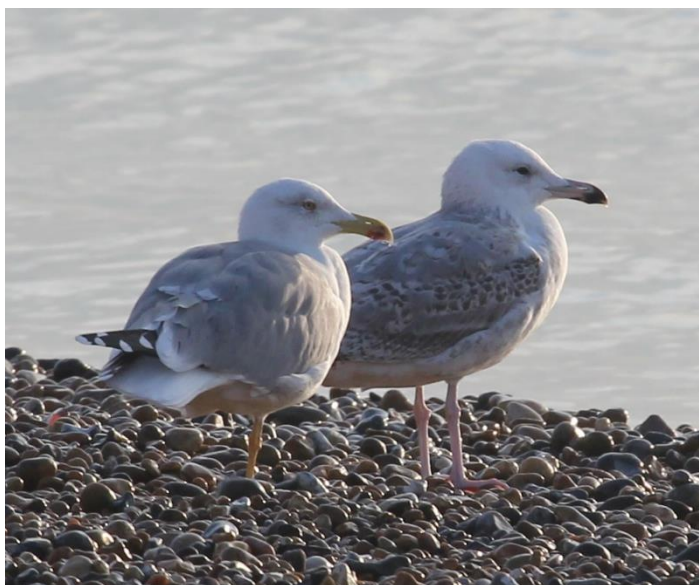
2CY Caspian Gull and adult Yellow-legged Gull at Sandgate (Ian Roberts)