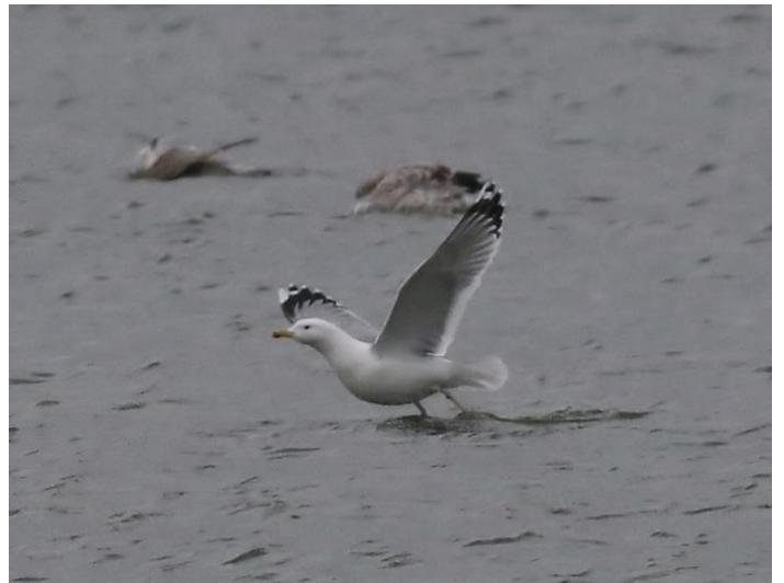
Adult Caspian Gull at Nickolls Quarry