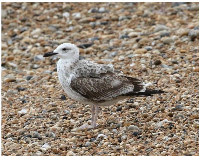
1CY Caspian Gull at Sandgate (Chris Powell)