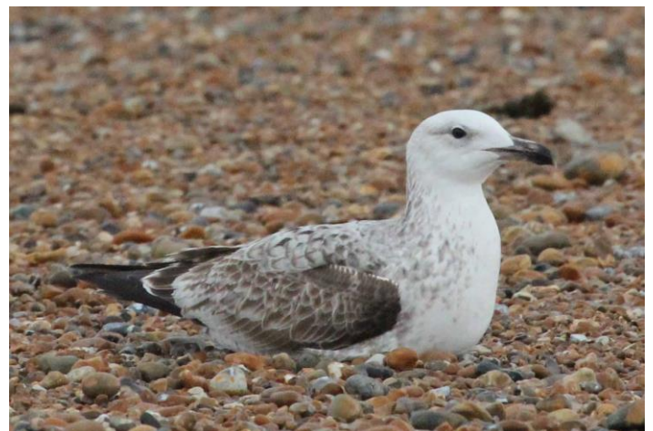
1CY Caspian Gull at Princes Parade