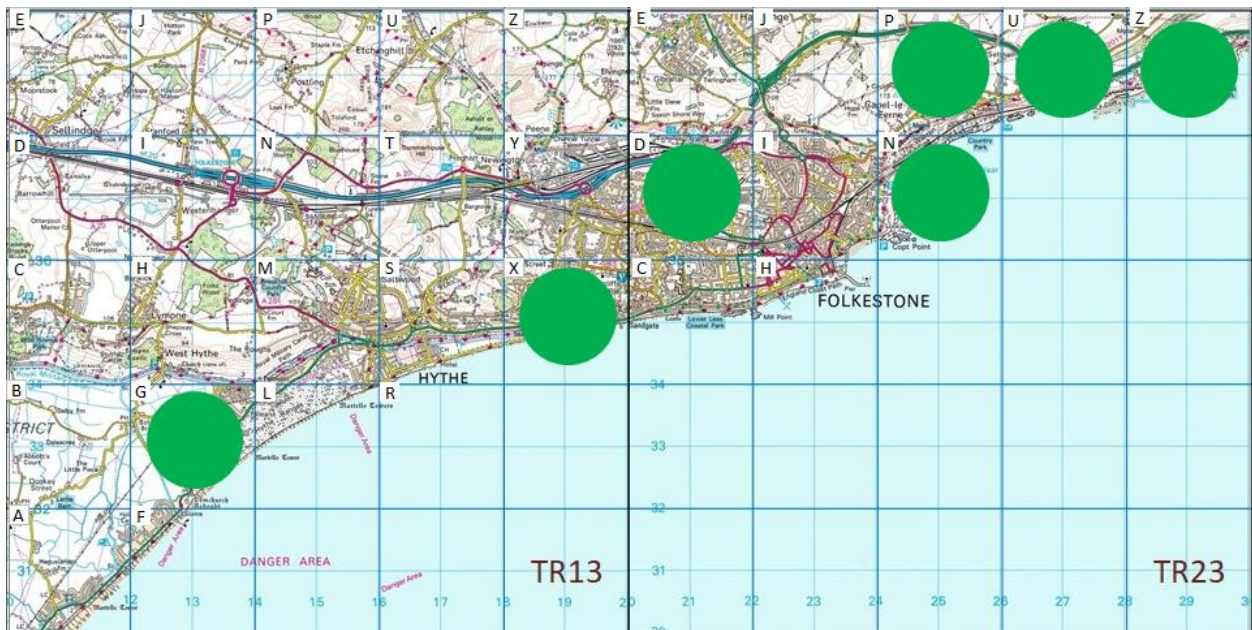
Figure 3: Distribution of all Montagu's Harrier records at Folkestone and Hythe by tetrad

Figure 3 shows the distribution of records by tetrad.