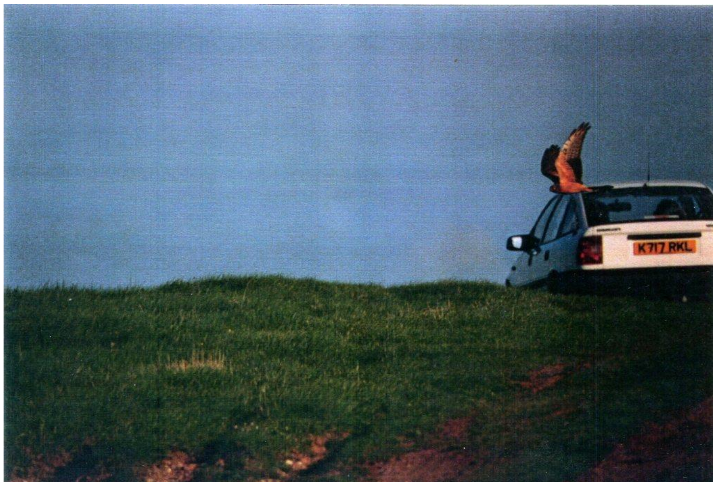
Montagu's Harrier at Abbotscliffe