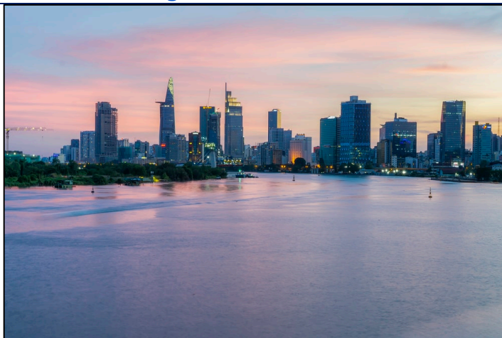
Ho Chi Minh City, Vietnam, July 10-14, 2022