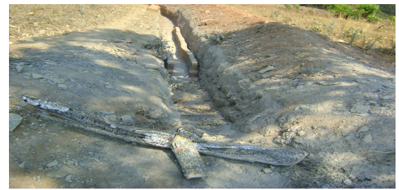
Since the promising breakage of the stone, not much has been done. Rather, more supervision is required and this advice is forwarded to supervisors so that they harness on the project.