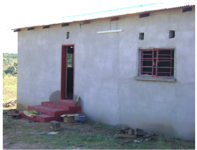
moisture showing first rains that led to immediate use