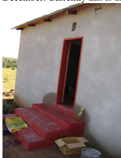
Canteen currently set for cooking

The canteen is almost finished now. There is only painting, ceiling and plumbing remaining which were awaited by the finished beam filling, electrical wiring, flooring and plastering. Looking at the state of the wooden structure, the orphanage has been forced to start using it for better health, and that other activities can be finished in December. Currently this is the position of the canteen/Laundry.