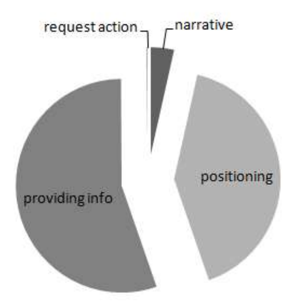
Figure 1. Distribution of Twitter speech acts by Korean politicians

inspired by the concept of speech act, the codes in our scheme are not mutually exclusive and allow us to better capture what officials are trying to accomplish when they post a tweet. This is particularly important in terms of political communication, as MOAs are often engaging in multiple actions at once. Our approach provides a stark correction to Golbeck, et al. (2010), who found that a single speech act, "providing information," described almost all tweets posted by members of the U.S. Congress (over 98% of tweets in their data set). Our coding scheme accounts for more fine-grained actions as compared to that of Golbeck and colleagues, providing us with better insight into a MOA's overall communication strategy on Twitter. Three sets of one hundred tweets were randomly drawn from the sample, and we calculated Cohen's kappa scores (Cohen, 1968) for each code and found very strong agreement between coders.* In the sample generated for the coding process, shown in Figure 1, positioning and directing to information were by far the most common actions exhibited on Twitter.