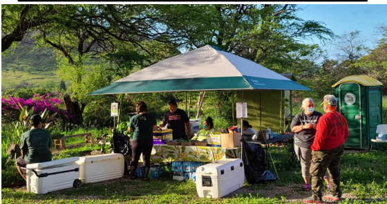
Mahalo nui loa to those who came out to Mālama Ka‘ala on the road to Ka‘ala Farm on Saturday, March 20th.