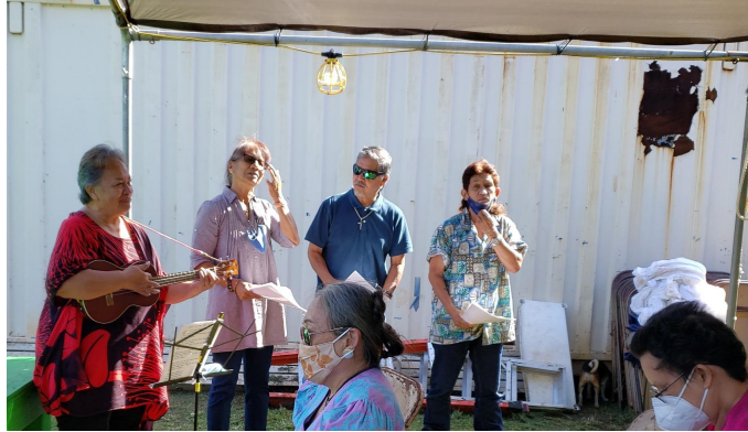
A gathering to celebrate at the new farm home in Waimanalo.

From those who were blessed, to the common+unity at large, we would like to extend our love to Aunty Blanche for stepping up.