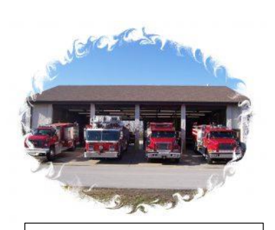
A big thanks to the Duenweg Fire Dept