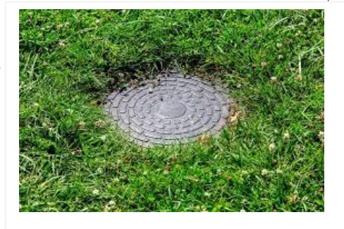
Please don't cover up our manholes, thanks!

help keep your lines and the City's sewer running more efficiently: *Take care of grease the right way, never pour it down the drain! (this is one of the main reasons for blockage) *Wipes, paper towels, towels, feminine products, diapers, and other similar products should not be flushed, even those that say they are flushable can cause issues *Tree roots can cause blockage *You can have a City of Duquesne licensed plumber clean your lines as needed.