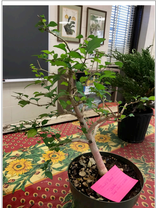
No cold temps for this little one

By consent of the dog owners, all three trees were sent home with our guests.