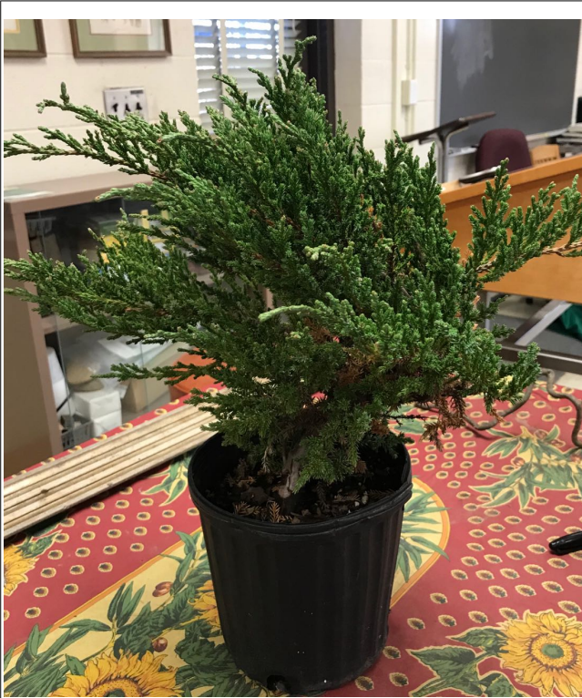
Bonsai staple for budding artists - Juniper