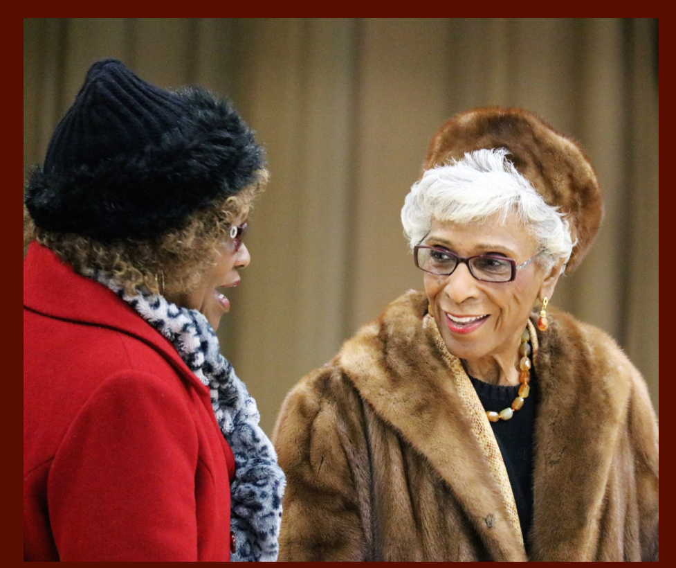
"Aging with Grace: From Whence We've Come"