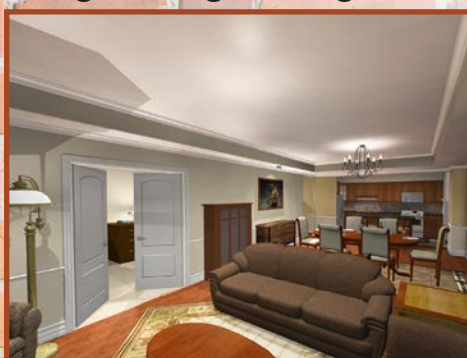
Large Living/ Dining Areas