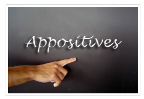
Appositives are an essential part of English writing. Our editors help explain their function and usage.

An appositive is a noun or a pronoun (often with modifiers) that is beside another noun or pronoun, usually with the purpose of explaining or modifying it. Now don't get nervous—we are ap-positive you'll be able to figure this out.