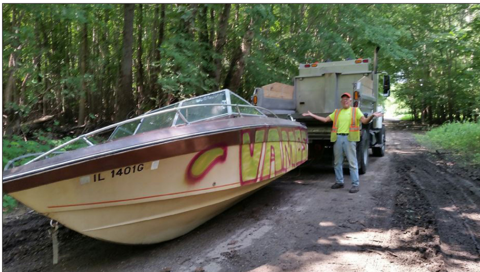
Blackhawk Road Commissioner, Bruce Stickell stands next to an abandoned boat he and his crew removed from Canal Road.

In addition to mowing and maintaining the Township roads, Bruce and his crew continually remove old tires and trash. Thanks Bruce and Rick for keeping Big Island lookin' good!