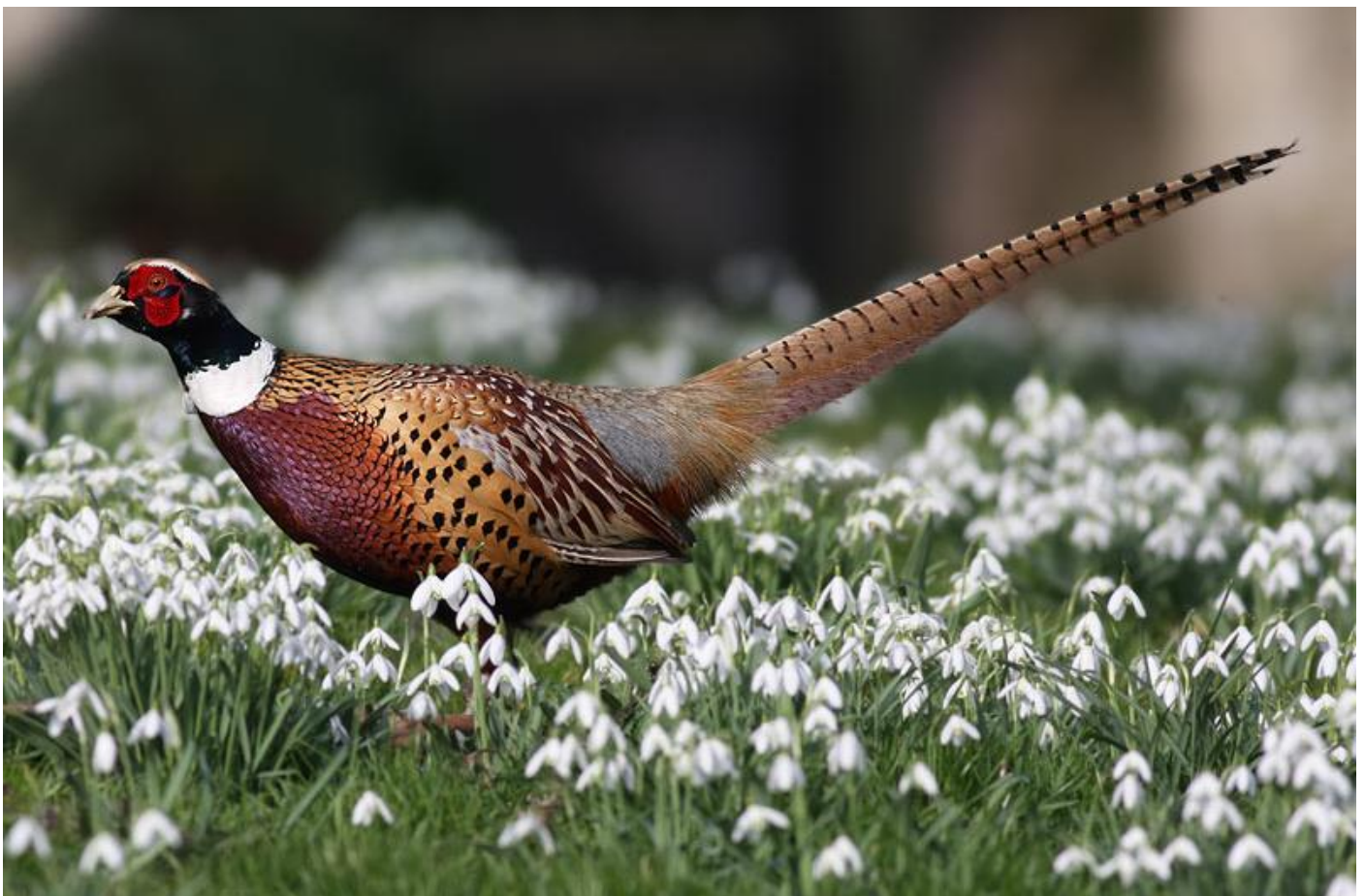
Pheasant at Saltwood Castle