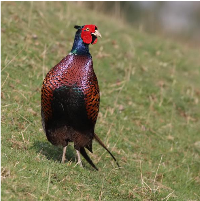
Pheasant at Saltwood Castle (Brian Harper)