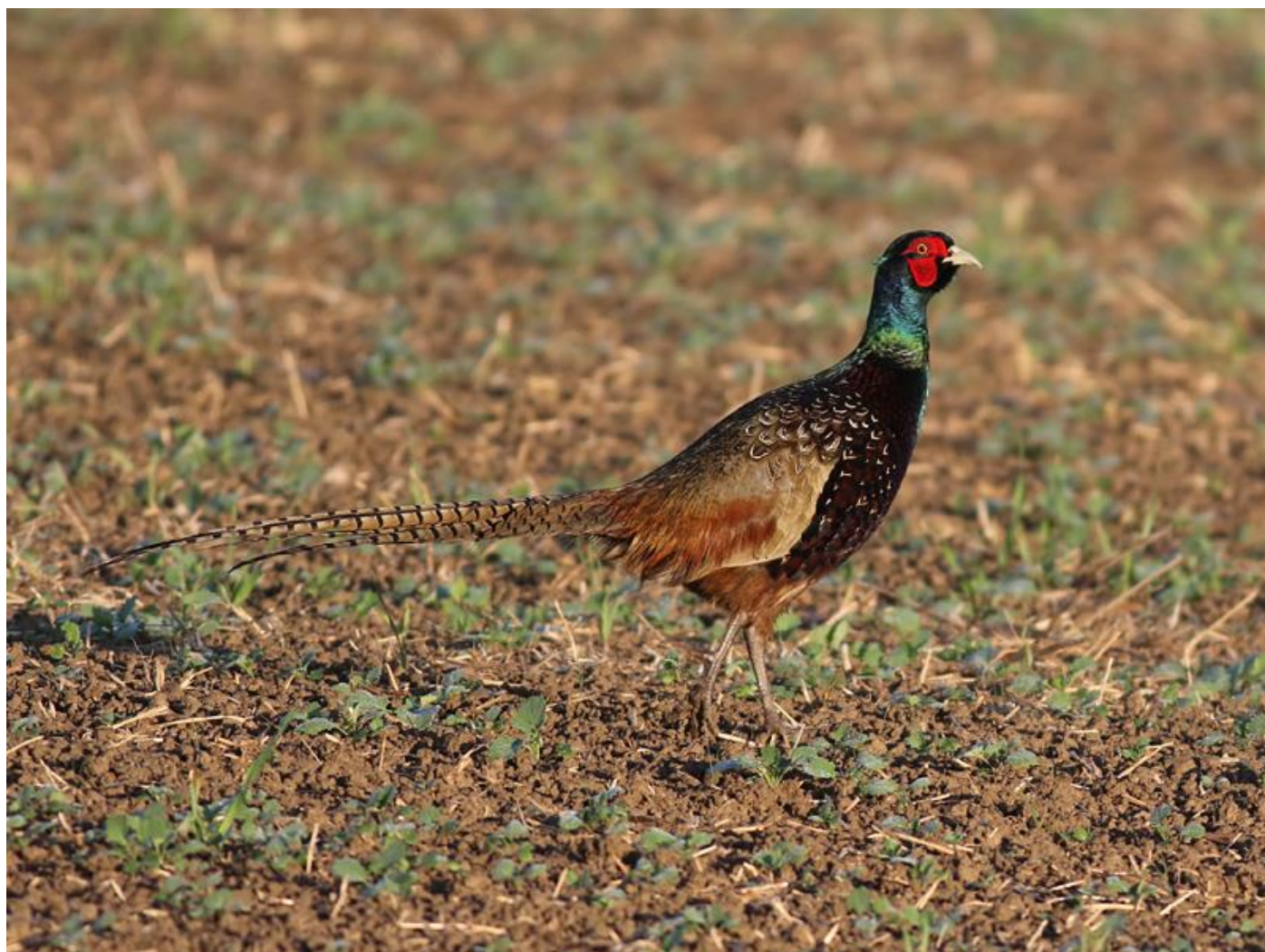
Pheasant at Lower Wall Road