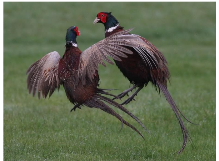
Pheasants at Hotel Imperial Golf Course (Brian Harper)

Native to the Caucasus and the Balkans, eastwards across middle latitudes of Asia to eastern China. Introduced widely into Europe, for example into Italy in Roman times, into Britain probably in the late eleventh century and into Scandinavia in the eighteenth century. Also introduced into North America and parts of Australasia. It has a complex history of introductions and extinctions. Indigenous and introduced populations are resident or sedentary. Numbers fluctuate markedly due to the scale of releases, hunting pressures etc.