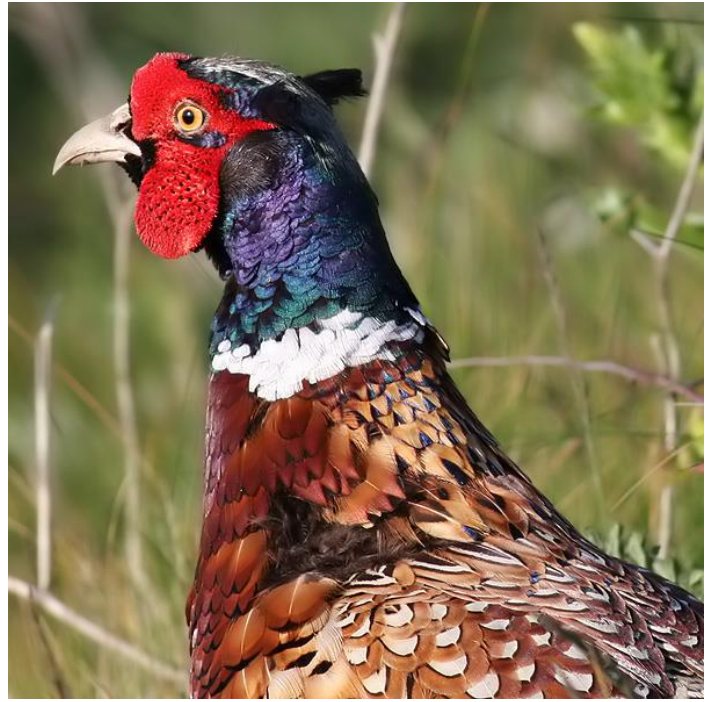
Pheasant at Princes Parade