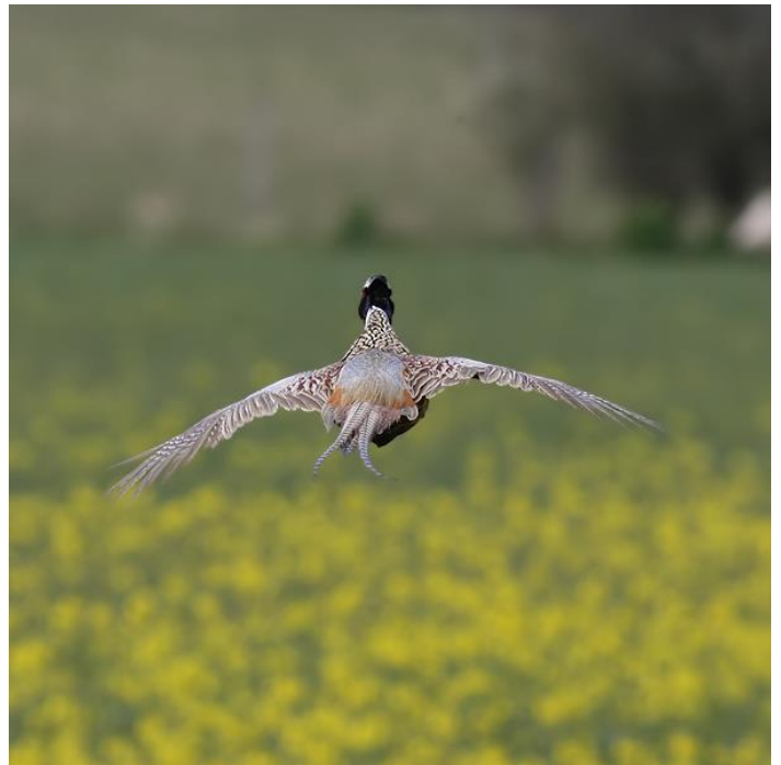
Pheasant at the Aldington Road

Click here to listen to a local audio recording of one calling at Lympe on the 28 th April 2022.