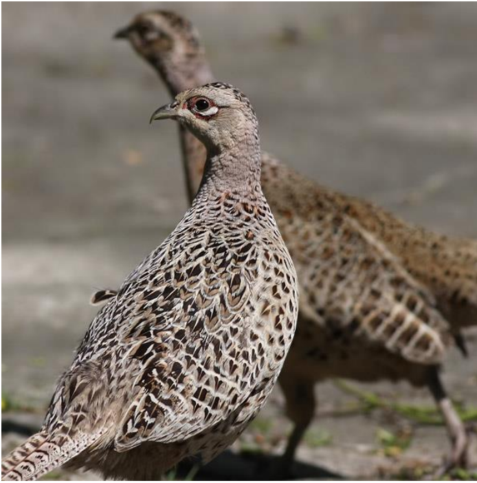
Pheasants at Saltwood Castle (Brian Harper)

Non-breeding birds are prone to wandering and may turn up even in small urban gardens.