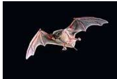
Brazilian free-tailed bat

The cheetah has four long muscular limbs to allow it to run fast for long distances.