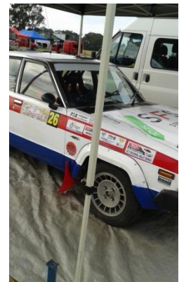
Above right: A real Rally Car!