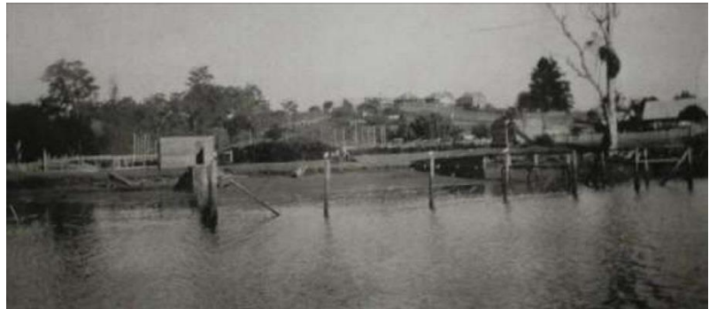
Nelligen baths 1935-36, downstream from the Steam Packet Hotel and Punt crossing.