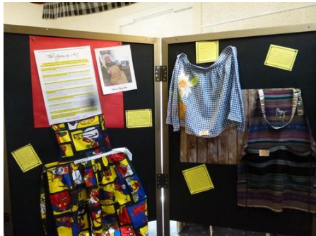
Left: Part of the 'Apron as Art' exhibition