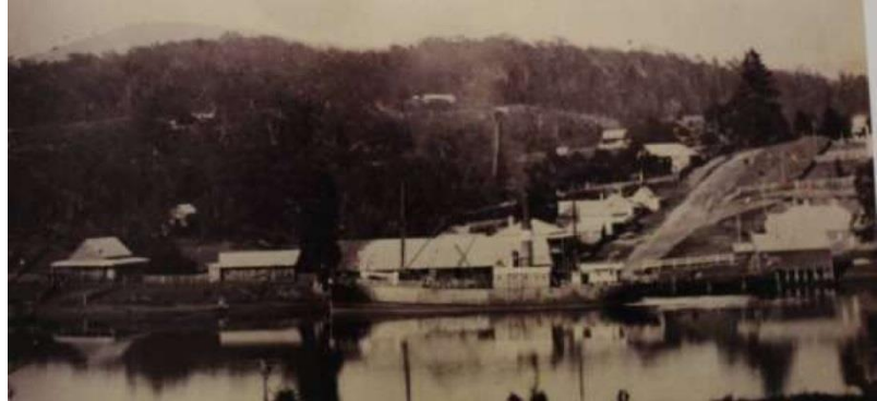
The SS Moruya served on the Clyde River from 1906 – 1912. The photo shows the old Cheese factory on the left with the small Presbyterian Church slightly behind it and up the slope. There is a gable roofed shed between the cheese factory and the ISN Co building. Manning's shed is to the right of the wharf.

On the opposite side of the river was a cow bell fastened to a post and I can recall that on many occasions, when returning from Moruya or Batemans Bay late at night, Dad would ring the cow bell and some 15 minutes later the punt would appear out of the gloom for Syd to wind us across to the Nelligen side, to the accompaniment of grunts and an audible commentary on inconsiderate people who insisted on being abroad at such unreasonable hours.