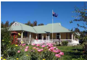
The Old Courthouse Museum