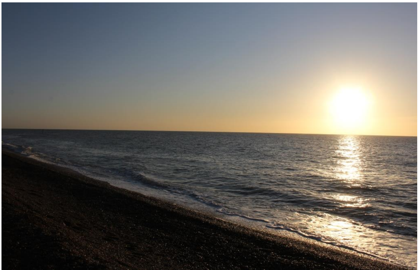
Looking south-east from Hythe Beach

The tetrad can be viewed from the seawall where there is free parking.