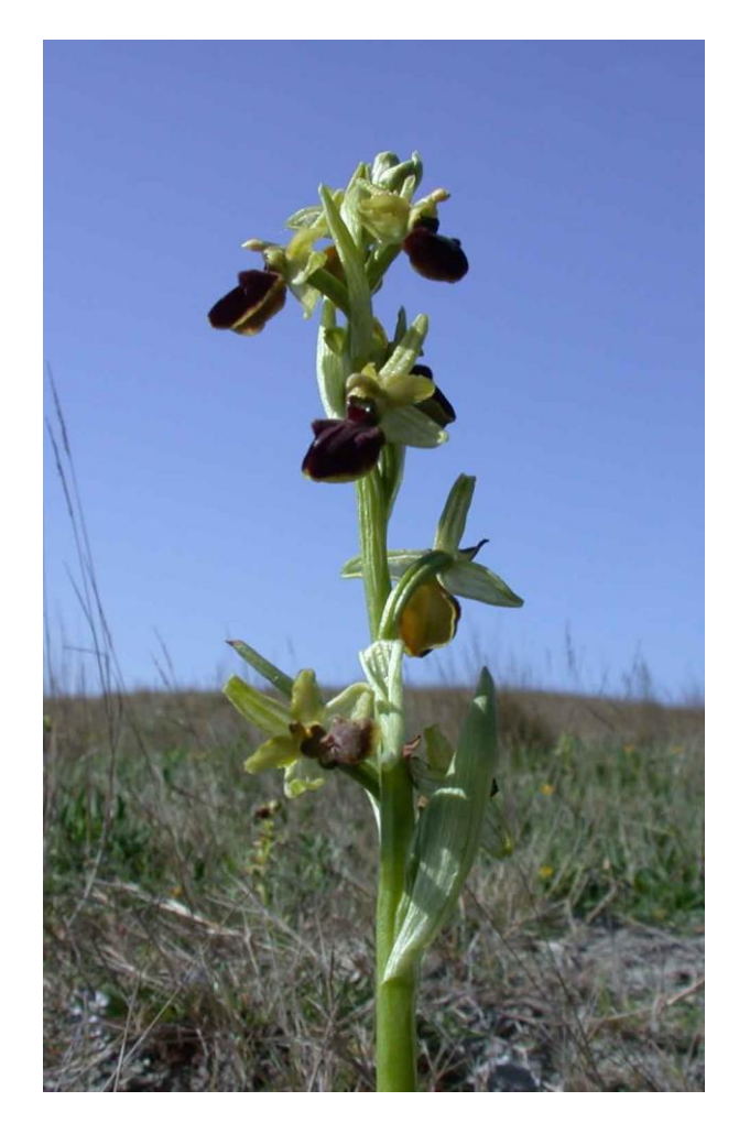
Early Spider Orchid - Samphire Hoe