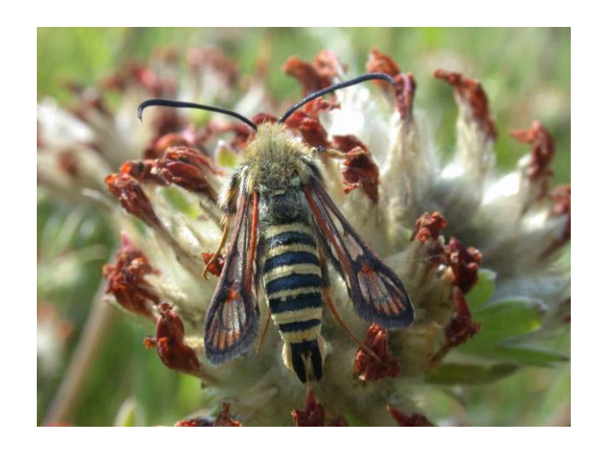
Six-belted Clearwing - Samphire Hoe