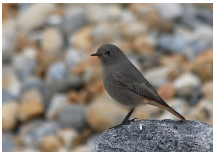
Black Redstart at Mill Point