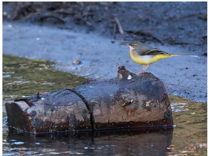
Grey Wagtail at Enbrook Park