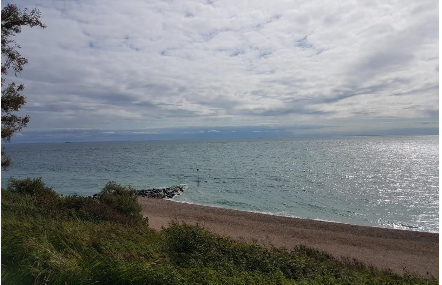
Looking south-east from the Lower Leas Coastal Park

The Lower Leas Coastal Park was created in 1784 when a landslip produced a new strip of land between the beach and the revised cliff line. The land was originally used as pasture and cattle were led down the cliff face to graze by means of a steep path that still exists today and is known as the Cow Path.