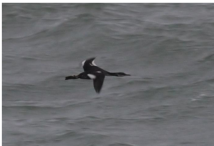
Red-necked Grebe at Sandgate

Enbrook Park was established in 1806 by John Bligh, the fourth Earl of Darnley, who acquired the land and planted it with flowering shrubs and trees, and now hosts Saga’s head offices. It holds a typical range of woodland species such as Green and Great Spotted Woodpeckers, Jay and Treecreeper, whilst Chiffchaff and Firecrest overwinter around the small lake, which has breeding Moorhen, and regularly attracts Grey Wagtails and sometimes Water Rail. It would appear to offer suitable habitat for migrant passerines but has not been well watched in the migration seasons.