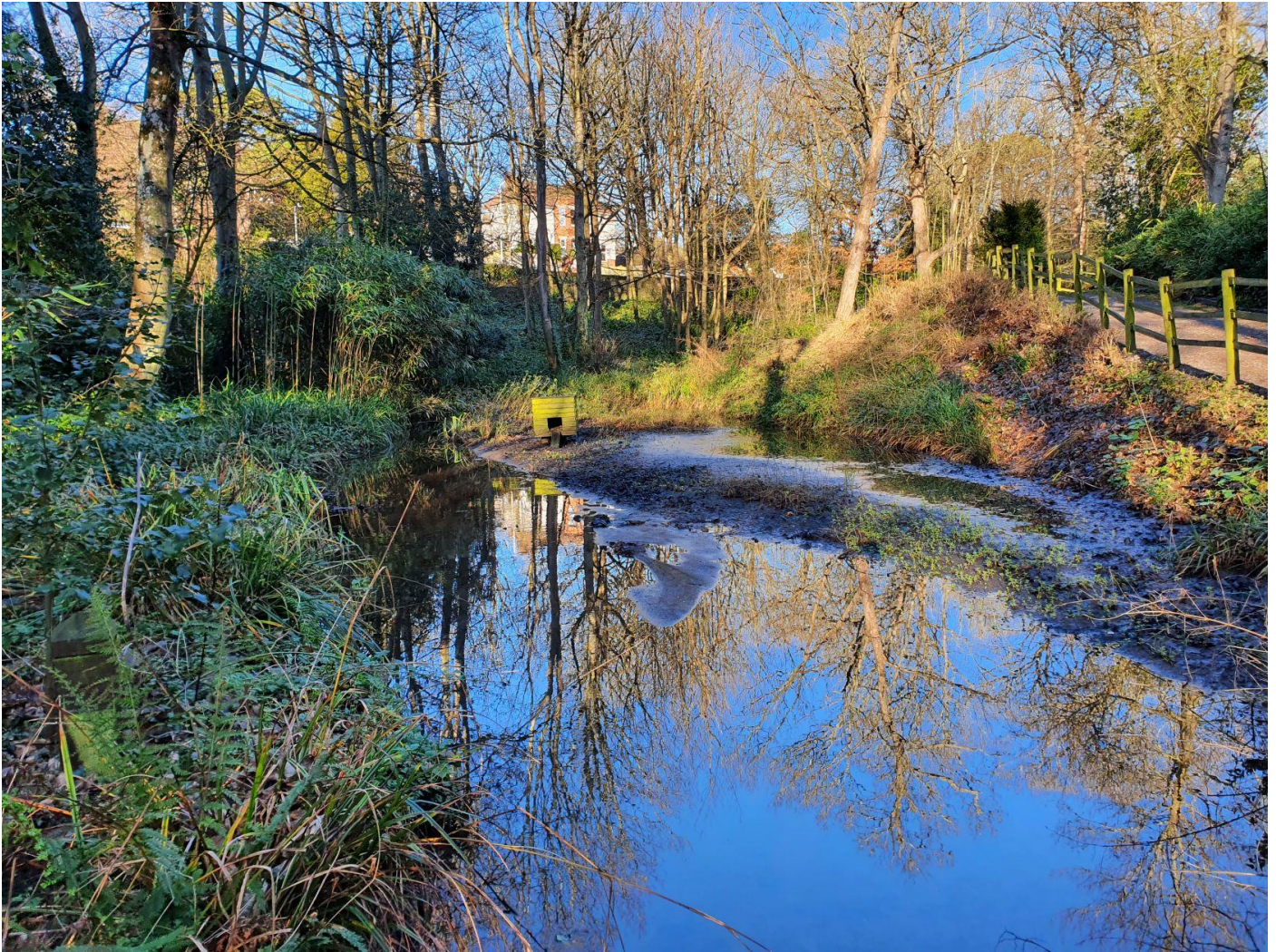
Small lake at Enbrook Park

The main road through the tetrad is the A259 is on several bus routes. Folkestone West train station is located just to the north of the tetrad in TR23D.