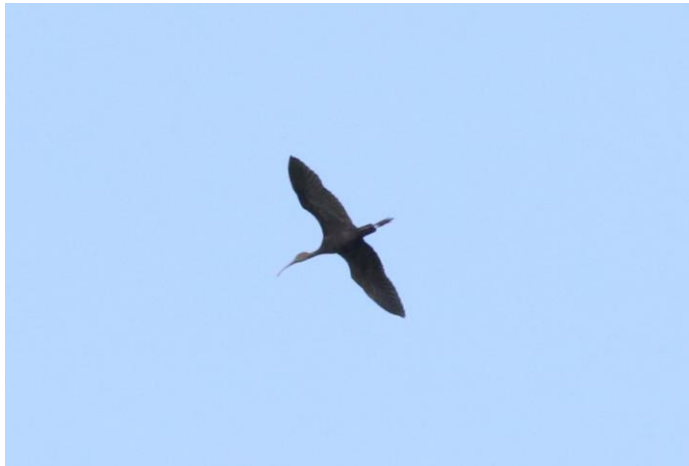
Glossy Ibis at Sandgate

The full list of species that have been recorded is provided as Appendix 1.