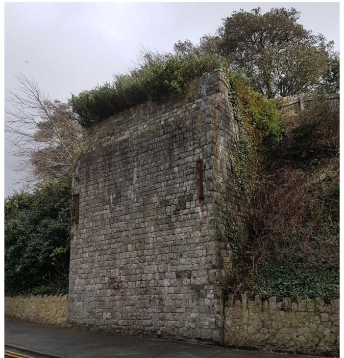
Remnants of a cliff lift bridge

The lifts were built to cater for the rapid expansion in tourism to the Folkestone resort which also led to the construction of some magnificent hotels such as the Metropole. When it opened in 1897 it had 200 bedrooms, as well as a central hall, two dining rooms, a ballroom, library, and smoking, writing and drawing rooms, all decorated in oak, gold lacquer and gilt, marble and velvet. The hotel was an immediate success and in the early days was patronised by royalty and nobility. In 1903 The Grand Hotel opened next door and King Edward the VII was among its guests. Both hotels are Grade II listed, as are a number of fine private residences in the tetrad, such as Spade House which was home of the writer H.G. Wells from 1901 to 1909.