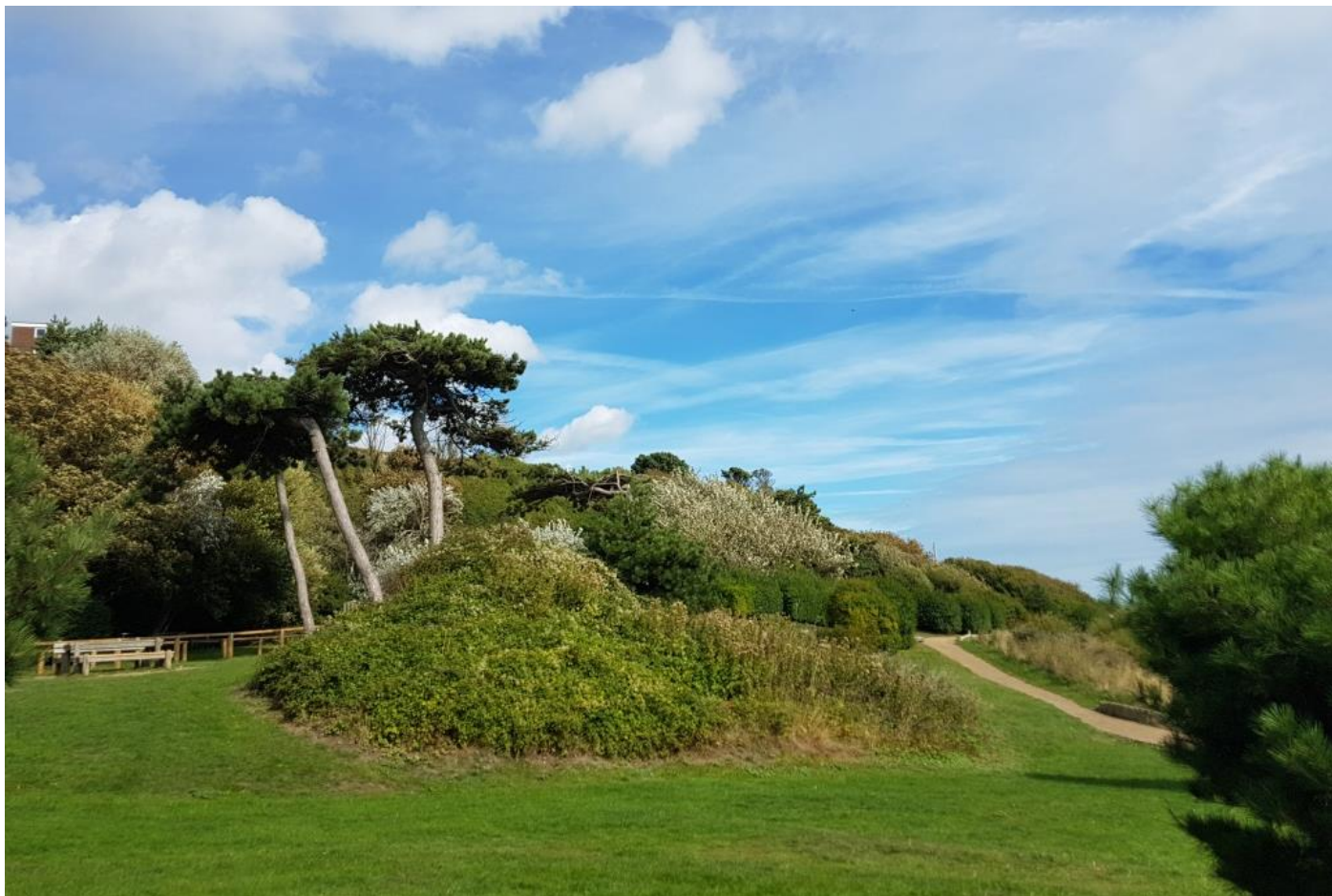
The Lower Leas Coastal Park

The whole coastal area is known locally as “Mill Point” and has been regularly watched since 1988, with a total of 174 species having been recorded here (the full list is provided as appendix 3).