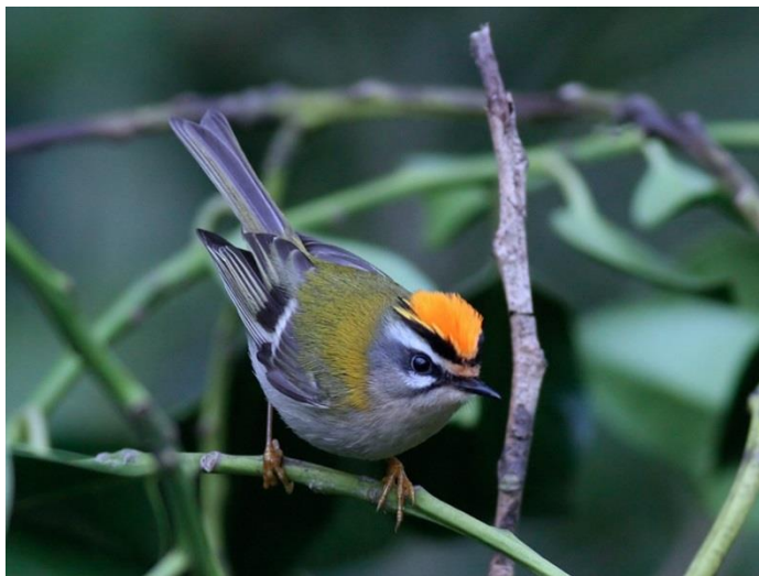
Firecrest at Enbrook Park