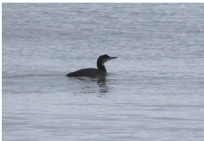
Great Northern Diver at Sandgate