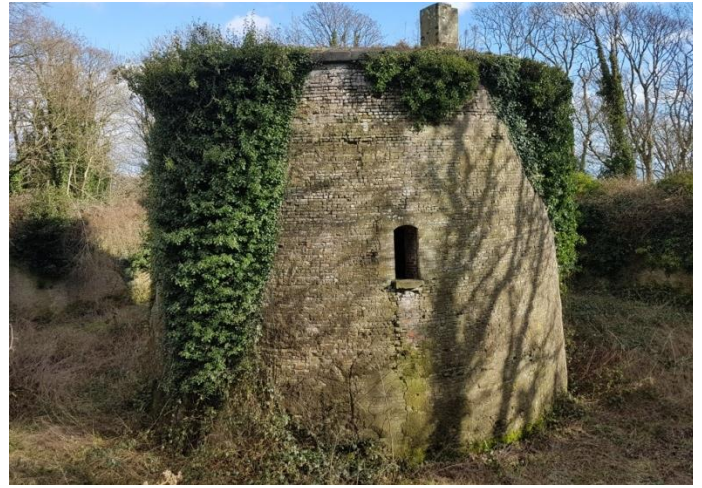
Martello Tower 6

In 1893 a cliff lift was constructed at Sandgate Hill but this closed in 1918 and a further lift at the Metropole hotel was established in 1904, running until 1940. These were demolished but traces of both can still be found today.