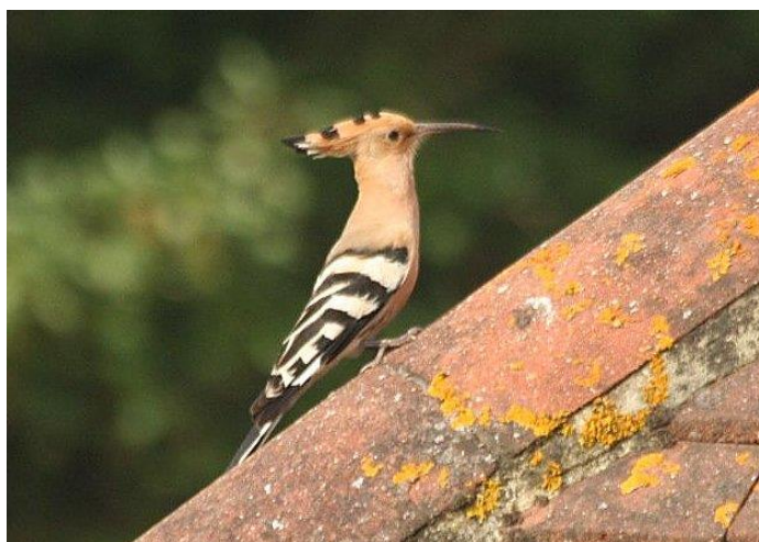
Hoopoe near the Grand Hotel