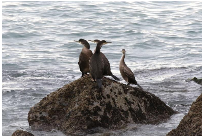
Shags at Sandgate