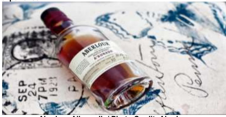
Aberlour A'bunadh

A'Bunadh [a-BOON-arh]—"Original" in Gaelic—is a single malt whisky that is aged solely in Spanish oak oloroso sherry butts. This was designed as a replica to a whisky that was produced at this distillery in the late 1800s. Expect a huge fruit and spice experience.