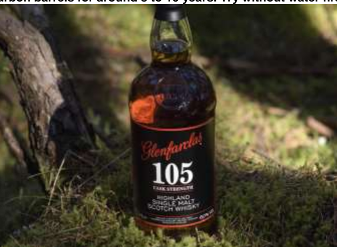
Glenfarclas 105 Cask Strength ARRAN MACHRIE MOOR CASK STRENGTH

In 1968, Glenfarclas was the first to release a cask strength single malt whisky. This bottling was re-named to 105, the British alcohol proof equivalent for 60% alcohol by volume. The single malt matures in a combination of ex-sherry and exbourbon barrels for around 8 to 10 years. Try without water first!