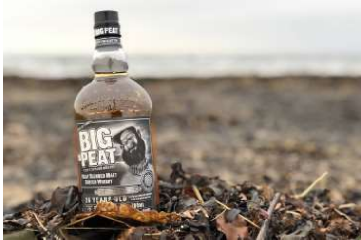
Big Peat Platinum Edition 26 Year

So I said, 'Please sketch me a big Islay fisherman who's just coming of his boat.' The designer then drew me Big Peat, but he was smiling. I said, a bit cheeky, 'No, he's just about to meet his wife, so he needs a big drink of strong Islay whisky.' So, he rubbed out the smile and drew in Big Peat's grimace."