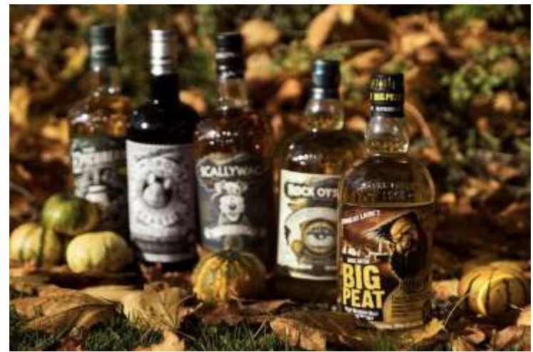
Big Peat with other Douglas Laing & Co bottlings

Laing: "Obviously we had more stock of Port Ellen ten years ago. But nowadays I can put Port Ellen in with a little more confidence than I used to. As our casks get up to 35 and 36 years of age, I notice that they've lost some of the big phenolic, iodine and maritime influences. In all fairness to our single cask category, I can't release these with any confidence. But it's still a very attractive name to have on any whisky bottle. I will not tell you what the percentage of Port Ellen is in Big Peat. It's not a lot, but it's certainly in there."