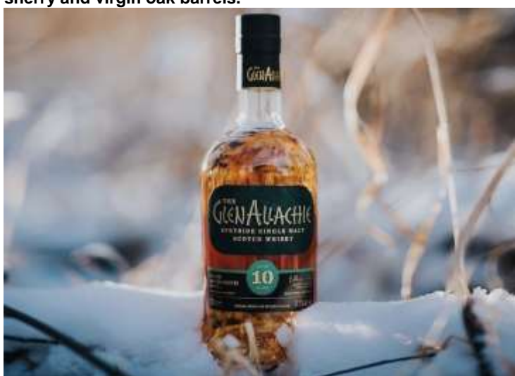
The Glenallachie 10 Year Cask Strength