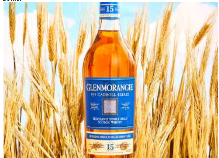
Glenmorangie The Cadboll Estate 15 Year

Glenmorangie The Cadboll Estate 15 Year is available in the US, Canada and Mexico as of March 2020 for a suggested price of $85 per 750ml bottle.