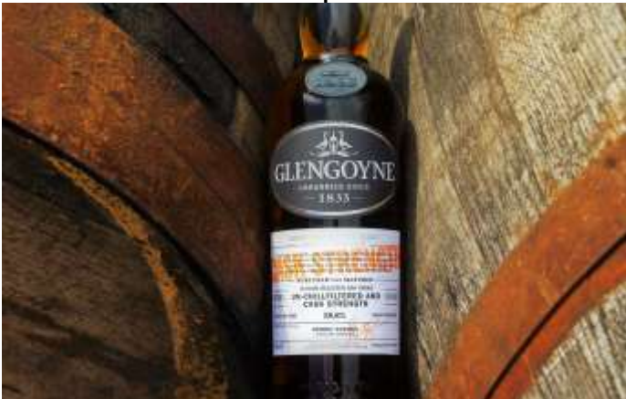
Glengoyne Cask Strength BENROMACH CASK STRENGTH VINTAGE 2008

Glengoyne is known for using sherry cask in its maturation process. In fact, some cask strength batches were matured exclusively in them. However, the most recent batch 7 used bourbon barrels and refill casks in addition to first-fill European and American oak oloroso sherry casks. Expect to find toffee and vanilla notes as well as tropical fruits and nuts.