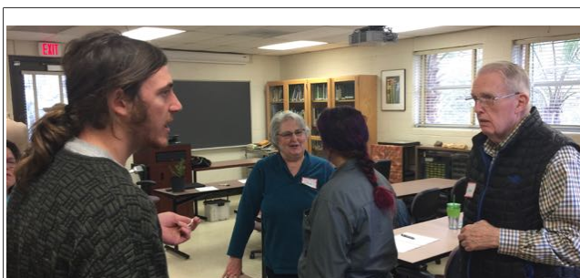
2017 is off to a great start with a couple of visitors and potential BSC members.