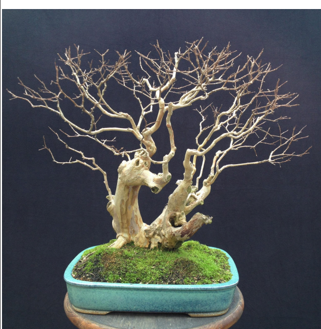
Crape murder air layer.