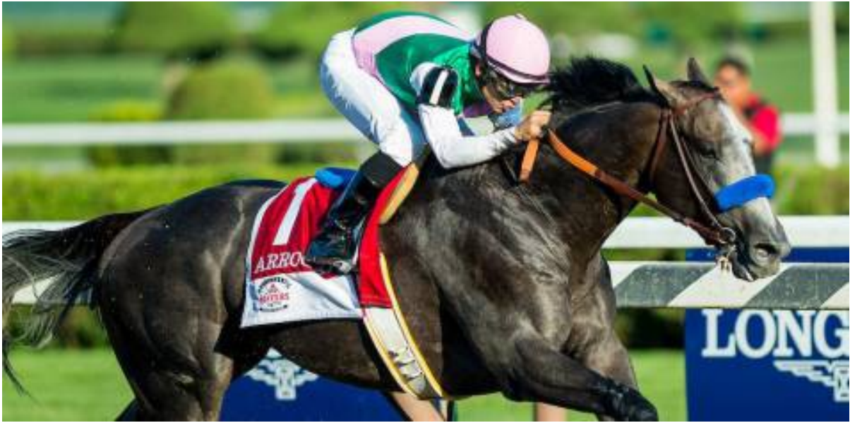
Arrogate winning the Travers Stakes