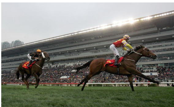
Designs On Rome