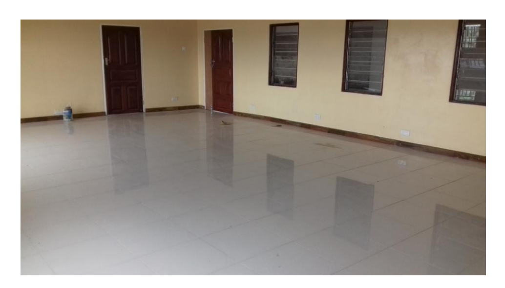
Conference room view