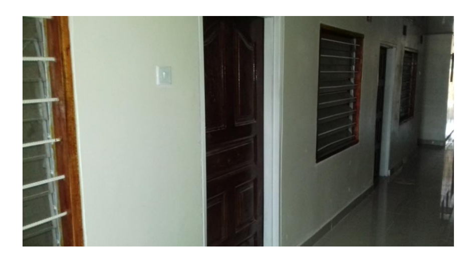
Guest rooms - passage view