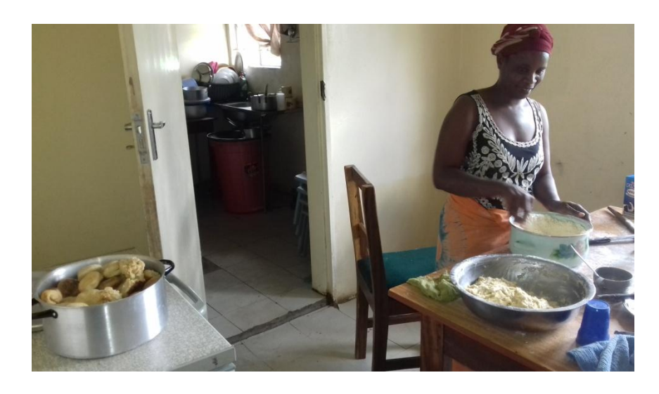
Matron Bakes cakes for orphans' party