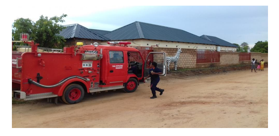
The fire brigade assessed the Lodge.