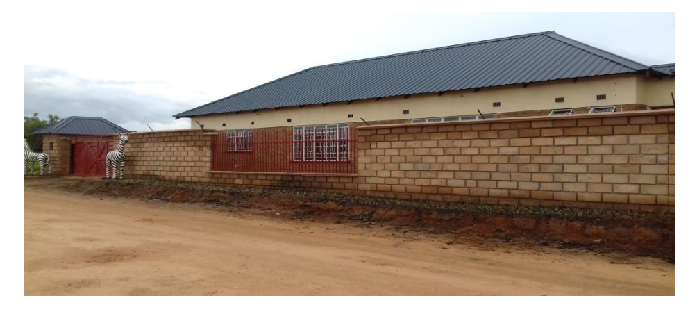
Fence at Guest house