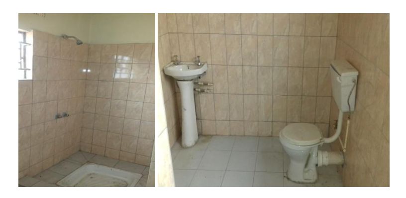
Showers and toilets in guest rooms