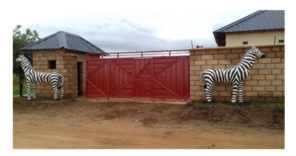
Guest house Entry Gate

The construction, painting, glazing, tiling, doors fixing and all that is needed to the building has now been finished. It is only furniture remaining. It is also already registered as SERENJE SOCH INN Ltd. The fire Brigade of Zambia from Serenje District Council also visited the site, assessed and left recommendations about what needs to be done for safety in case of fire. The pictures bellow indicate different views of SERENJE SOCH INN .