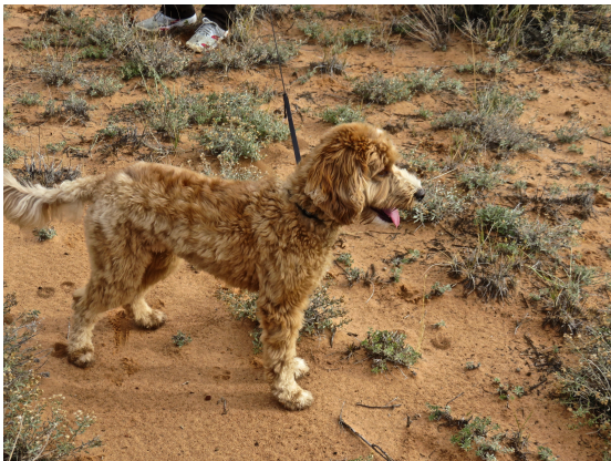
Archaeology dog “Chloe”

The entrance to the cave is marked with a Paiute petroglyph showing a birthing scene.