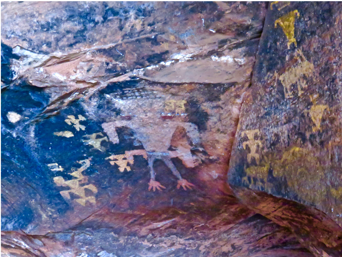
Inside the “Flute” Cave.

Inside the cave are pictographs in various colors on the blackened and red walls. These are done in the “Cave Valley Style” – the triangular shaped body, arms and legs.