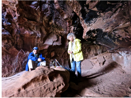
Feather inside the cave.

Inside the cave are pictographs in various colors on the blackened and red walls. These are done in the “Cave Valley Style” – the triangular shaped body, arms and legs.