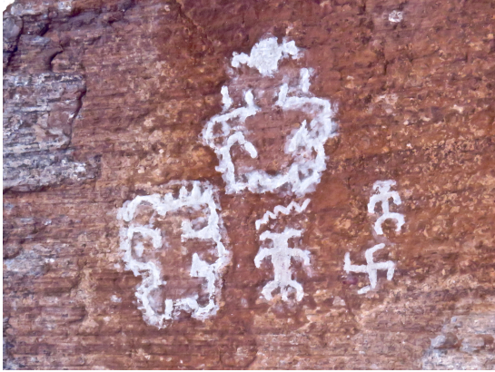
The birthing scene.