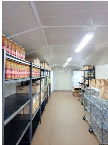
The Refinery Food Storage