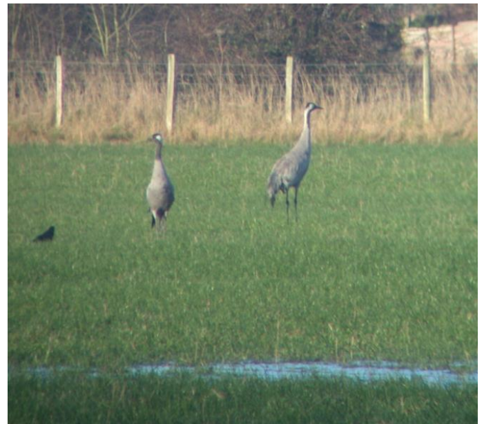
Cranes at Lower Wall Road (Ian Roberts)

It is a rare passage migrant and winter visitor to Kent, occasionally occurring in larger numbers on autumn passage.