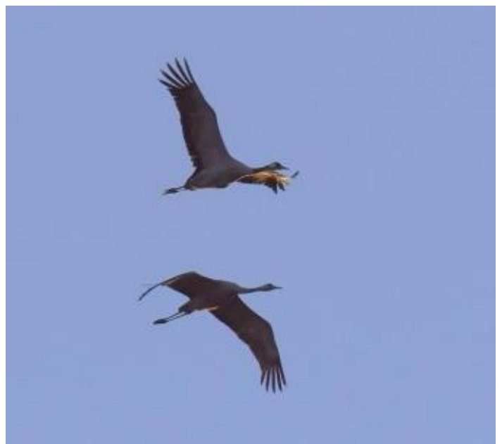
Cranes over Folkestone