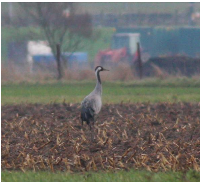
Crane at the Willop Basin