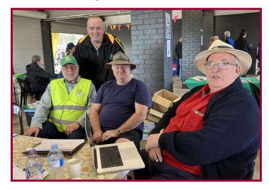
CMC Concours Judges hard at work with 35 vehicles to choose from