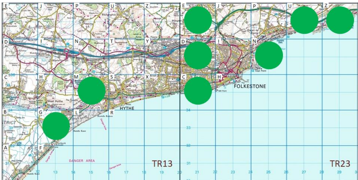
Figure 3: Distribution of all Twite records at Folkestone and Hythe by tetrad

Figure 3 shows the distribution of records by tetrad.