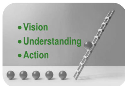
Leadership & Management