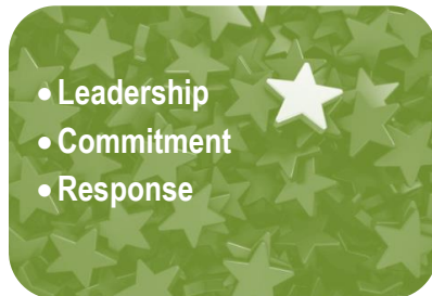
Race at Work Charter

There are 6 elements of the Race And Conscious Equality Charter Mark Framework. These are: