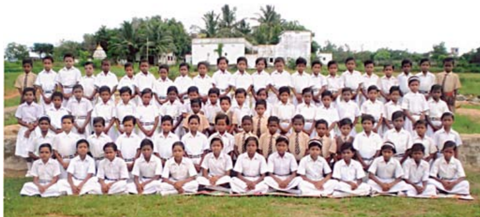
New and exciting opportunities await young people who have completed vocational training courses.