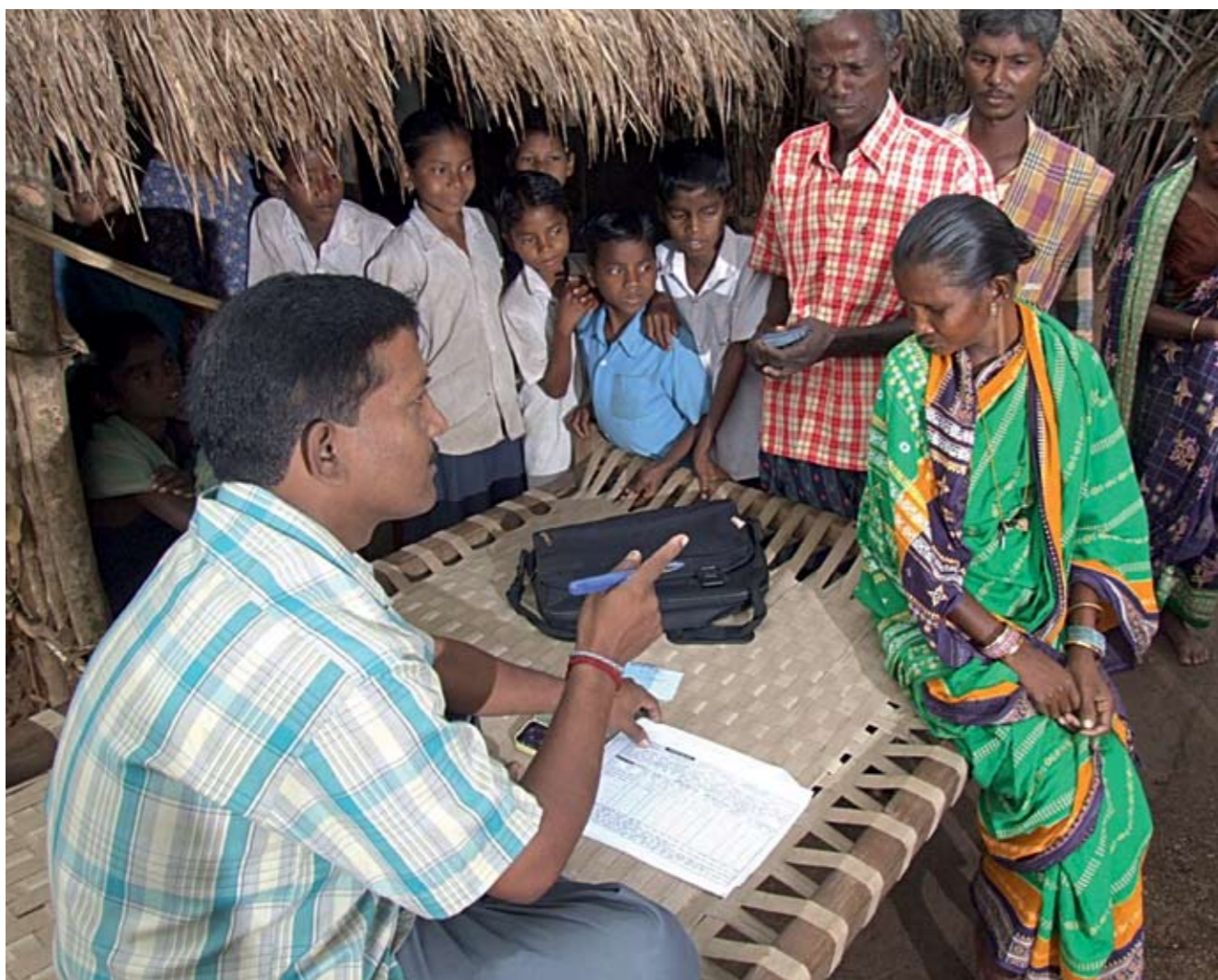
Left page: Free medication from Village Pharmacy Depots is effective in treating many common diseases, such as diarrhoea and typhoid. Before the PRHPS, people suffering with such conditions would be unable to afford treatment