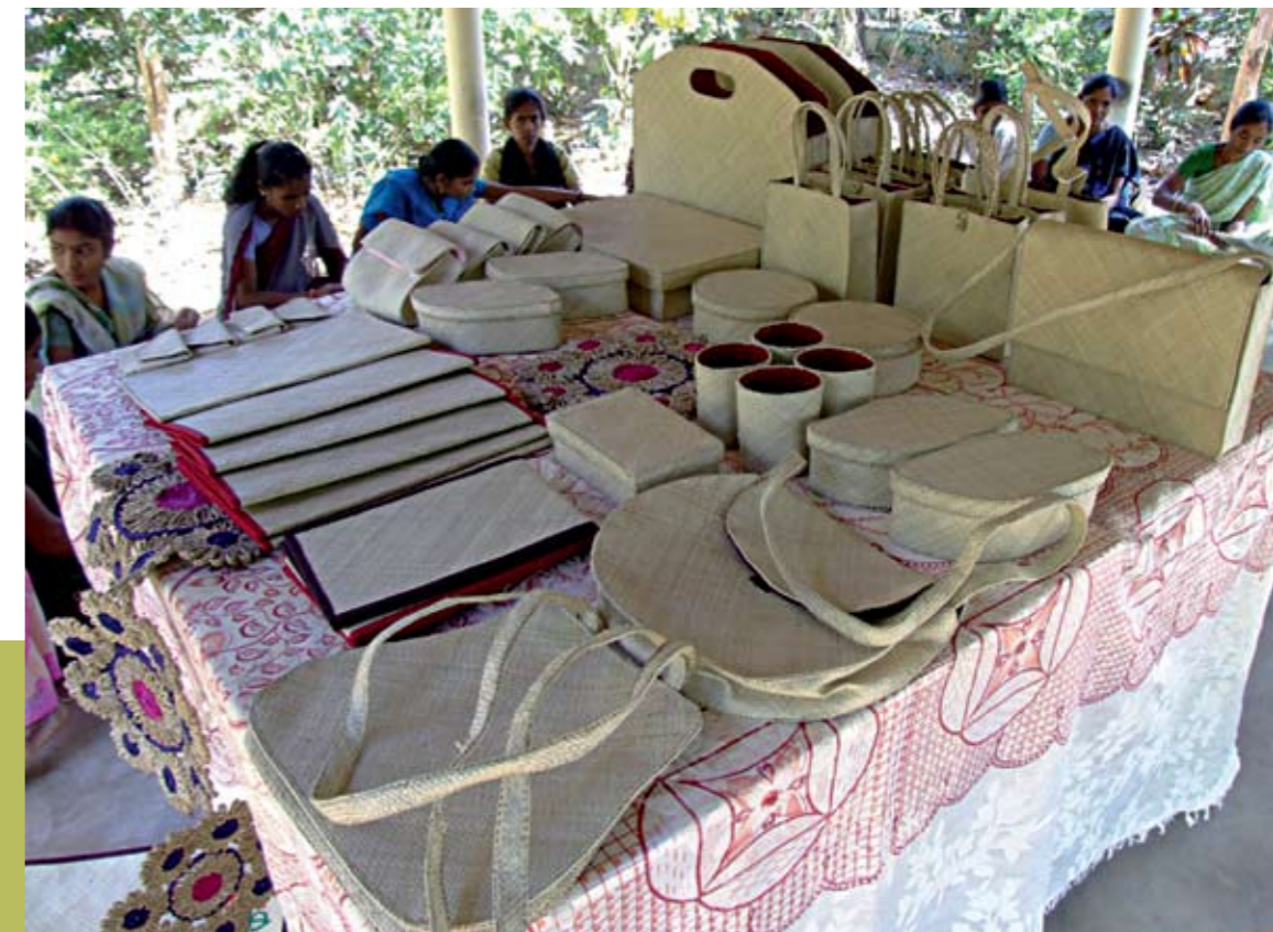
Left and right: SHGs Microfinance projects have enabled women to come together, developing entrepreneurial and leadership skills.