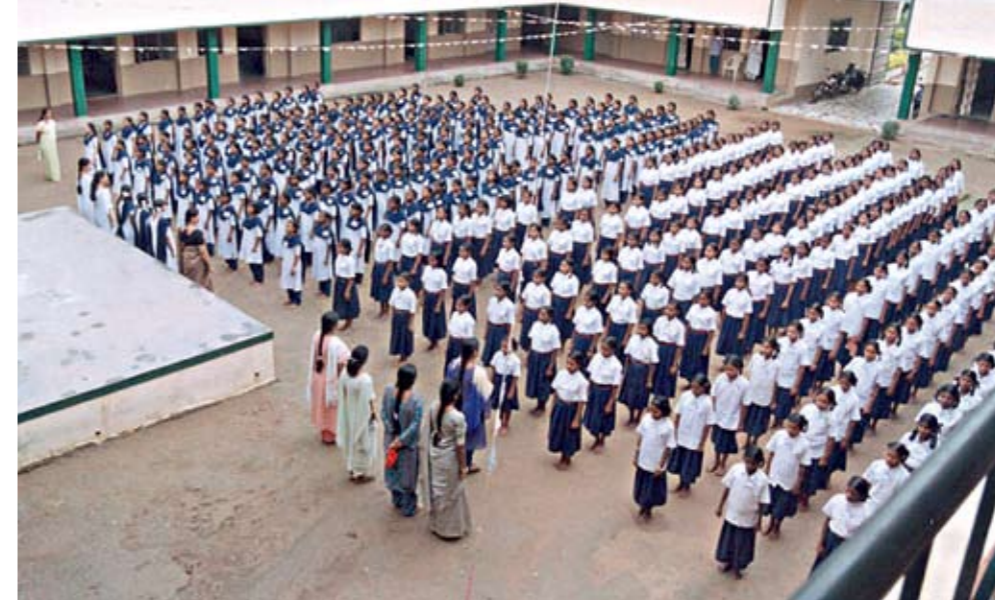
Left: In 1998 Bharat Mata residential facility opened its doors to girls from tribal villages