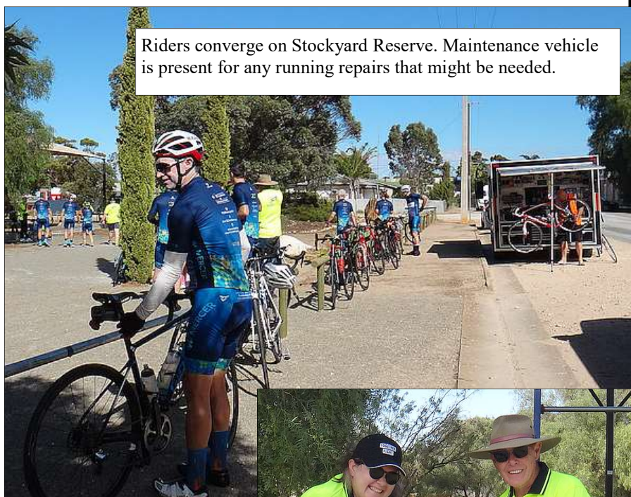
Riders converge on Stockyard Reserve. Maintenance vehicle is present for any running repairs that might be needed.