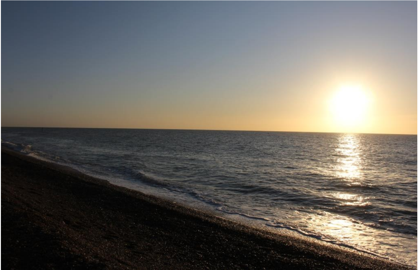
Looking south-east from Hythe Beach

Highlights have included Velvet Scoter, Goldeneye, Smew and Goosander, Black-necked Grebe, Avocet, Greenshank, Little Gull, Glaucous Gull, Long-tailed Skua and three species of Shearwater, among the more regular wildfowl, waders and seabirds. Turnstone may be found occasionally on the shingle whilst the few passerine records mainly relate to overhead visual migration.