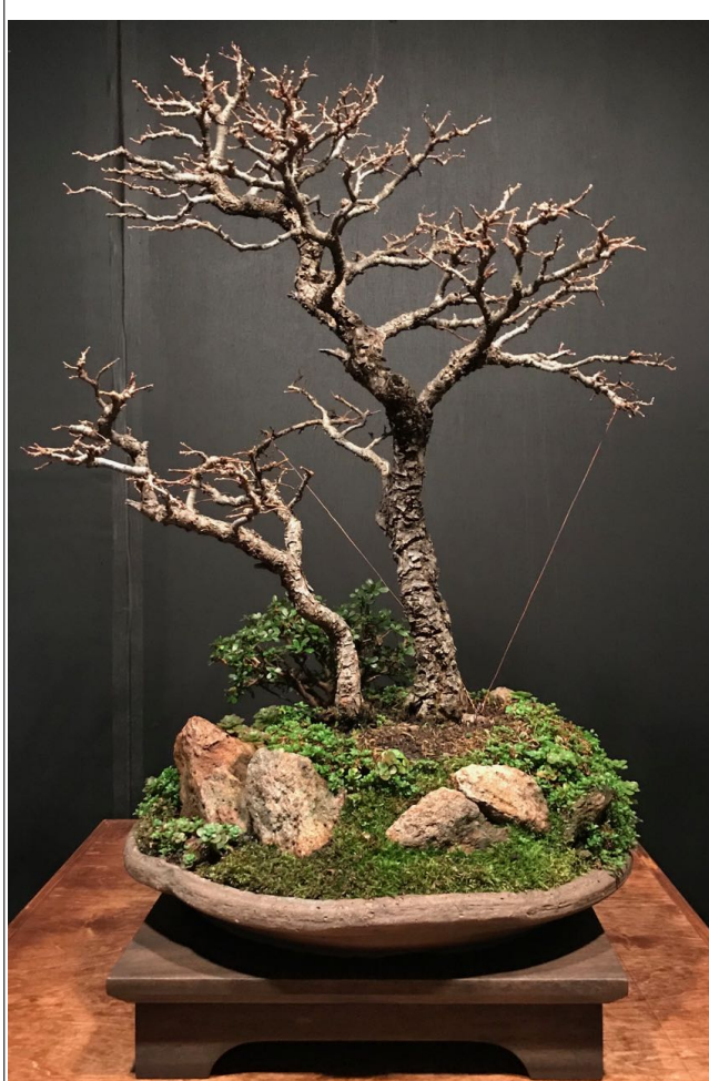
Chinese Elm Landscape - Arthur Joura