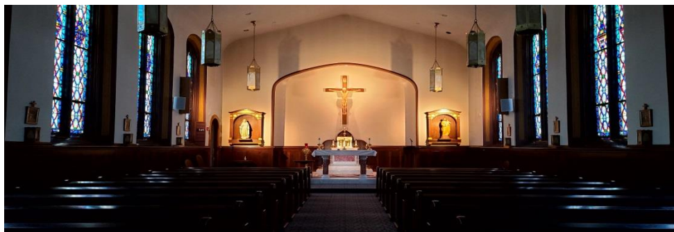
Saint Bernard's Chapel Mount Saint Mary's

The History Corner will continue to report in future issues how HDCCW has shared its gifts and talents the past 90 years.