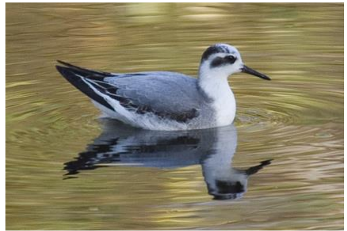
Grey Phalarope at West Hythe (Mike Terry)

Breeds in the extreme north of Europe, Asia, North America and Greenland. Winters off western Africa and western South America. Migrates almost exclusively by sea routes, occurring inshore or inland only under stress of weather. Occasionally large numbers can occur off Britain and Ireland following passages of vigorous Atlantic depressions. (Snow & Perrins, 1998).