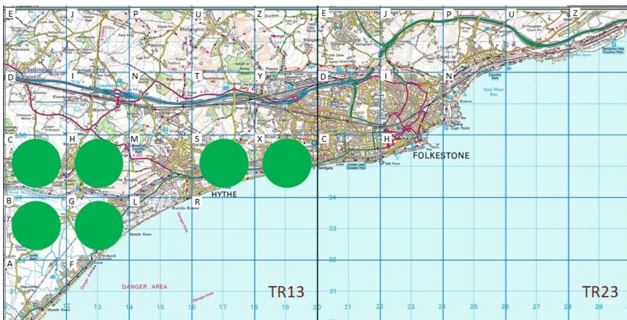
Figure 3: Distribution of all [Species] records at Folkestone and Hythe by tetrad

Figure 3 shows the distribution of records by tetrad.