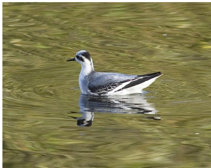
Grey Phalarope at West Hythe (Mike Terry)