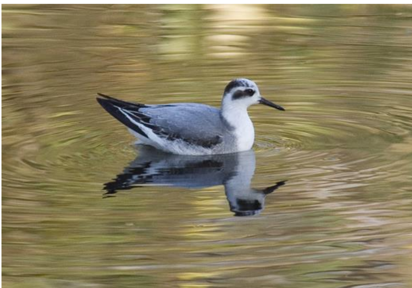
Grey Phalarope at West Hythe (Mike Terry)