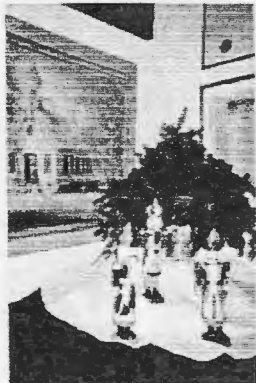
Decorations at the Silver Tea at our Museum in December