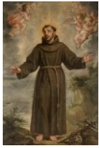
Saint Francis of Assisi

As a lifelong Catholic, Saint Francis of Assisi has always been one of my “go to” saints. Among the most venerated saints of all time, he was committed to following God’s will to rebuild the Church. The founder of the Franciscans, he embraced a life of humility, poverty, and devotion to the Eucharist. One of my favorite prayers, Lord, make me an instrument of your peace , (traditionally ascribed to him but never found in his writings) calls us to be Christ’s instruments of peace and love. In his Canticle of the Creatures Francis inspires us to praise and thank God for all creation. Francis received the stigmata two years before his death at age 44 and was canonized two years later. The patron saint of Italy, animals and ecology, his feast day is October 4.