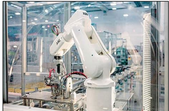
Precision Parts Assembly with 6-Axis Robot