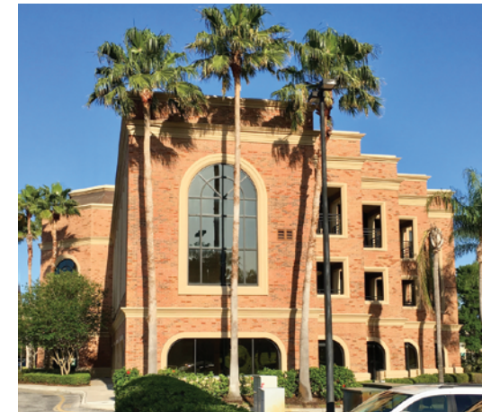
American Senior Services Incorporated