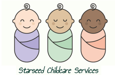
Starseed Childcare Services