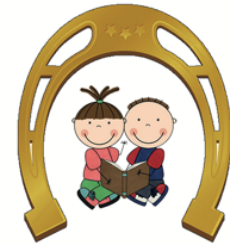
Rutland Early Years

In the unlikely event a child is lost, I will follow my procedure: